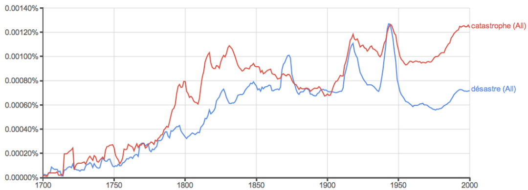
Fig. 3. Google Books Ngram frequency graph for the words " désastre " and " catastrophe " in French, from 1700-2000.

Such analyses suggest two things: first, that the usage of these words closely corresponds to the occurrence of events that we would now consider disastrous or catastrophic; and second, that at least in some ways and for part of the nineteenth century, disaster/catastrophe became an increasingly common word.