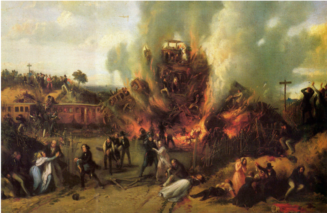
Fig. 4. A. Provost, Catastrophe ferroviaire entre Versailles et Bellevue le 8 mai 1842 , Château de Sceaux, Musée de l'Ile-de-France.

It was more than newspaper accounts that produced a spectacular relation between individuals and the Meudon disaster, however. As Mercier details, the public response included essays, poems, and songs. The description of the disaster scene even captured the imagination of artists, such as A. Provost. In his painting Catastrophe ferroviaire entre Versailles et Bellevue le 8 mai 1842 , he presents the scene as a staged spectacle (Figure 4).