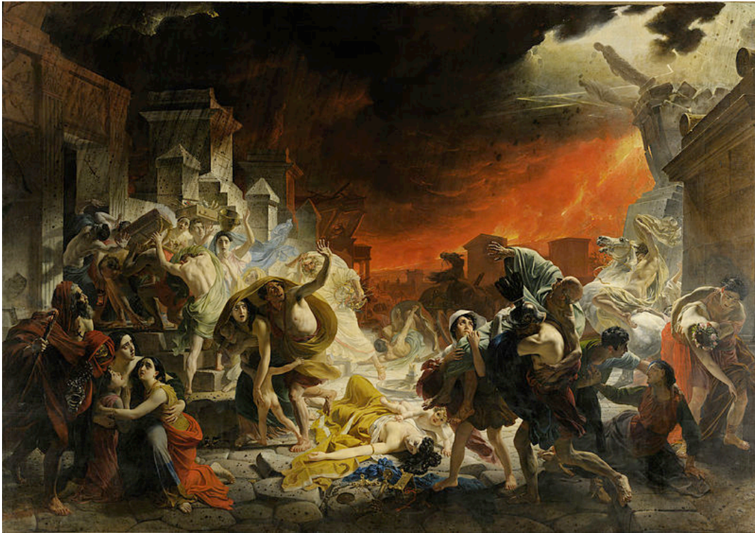
Fig. 1. Karl Briullov, The Last Day of Pompeii (1830-33), State Russian Museum, St. Petersburg.

Lytton was clearly impressed by the picture: "It is making a considerable sensation at Milan, and the subject of it is 'The Last Days of Pompeii.' The picture is full of genius, imagination, and nature. The faces are fine, the conception grand. The statues toppling from a lofty gate have a crashing and awful effect" (V. Lytton 440). And indeed, Lytton's novel makes use of just such a falling statue "effect" during the climactic eruption, as the villainous Egyptian Arbaces is crushed (with obvious colonial symbolism) by "a tall column that supported the bronze statue of Augustus" (399). In its relation to this painting, we can locate Lytton's novel within a broader movement that took disaster as a site for artistic production.