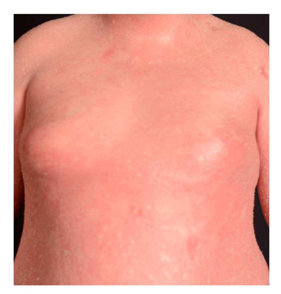
Figure 2. Spectrum of phenotypes of patients with CAPE Clinical appearance ranges from more psoriasis-like (a), mixed features of psoriasis and PRP (b), to PRP-like (c), to erythroderma (d).