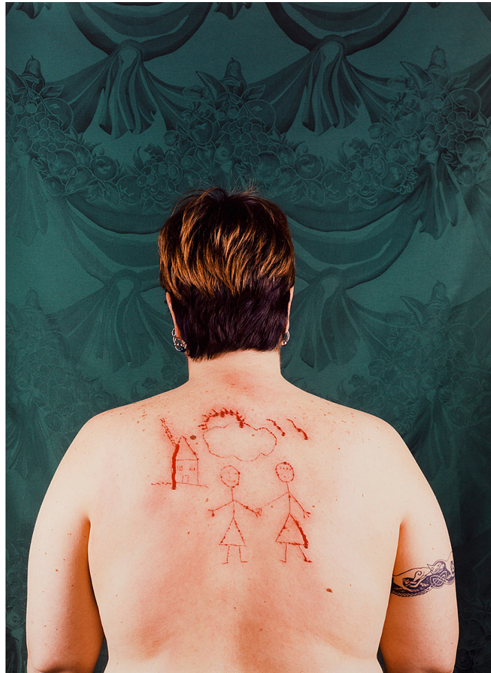
Fig. 3. Catherine Opie. Self-Portrait/Cutting . 1993, Guggenheim Museum, New York.

historian Kathy O'Dell argues that masochism can translate feelings of “senselessness, alienation, imbalance, and numbness into something constructive” (83). In essence, the destruction of one’s own physical form becomes reimagined as a generative aesthetic act.