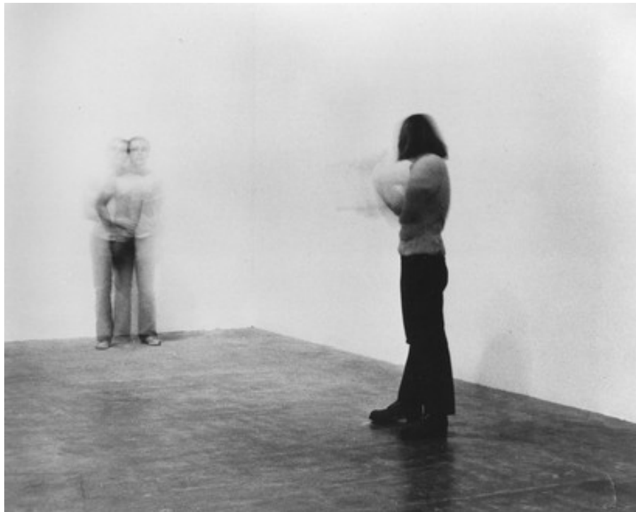
Fig. 2. Chris Burden. Shoot . 1971, F-Space gallery, Santa Ana.