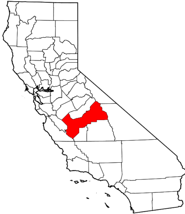
Figure 1 Fresno County Highlighted 1

The first time I drove to Fresno, California I expected to see a small farming community not unlike where I grew up. My hometown, Gilroy, California, famed “Garlic Capital of the World,” is approximately 2 hours Northwest of Fresno and is similarly a city dependent on agriculture as its economic lifeline. I considered myself familiar with agricultural-based community living. My father was part of a farm working family and used to take my brother and I around town and through the back roads of Gilroy to show us where he worked as a child, pointing out what crops he and his 10 siblings used to pick. I had imagined that Fresno would have the same