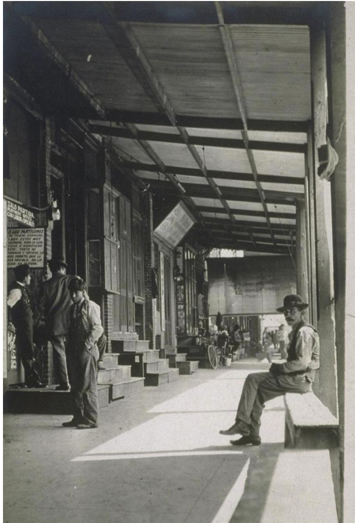
Figure 5.1 Mexicans at Employment Office in Chinatown, 1910s 386

Mexicans began heavily filling California's labor needs after the passing of the 1924 Johnson-Reed Act, also known as the 1924 Immigration Act. Although the Act did eliminate Asian migration and limit other foreign nationals, it did not give a numeric quota restriction for Mexicans. As Mae Ngai discusses in Impossible Subjects , this led to allowing Mexicans to enter for labor purposes and yet