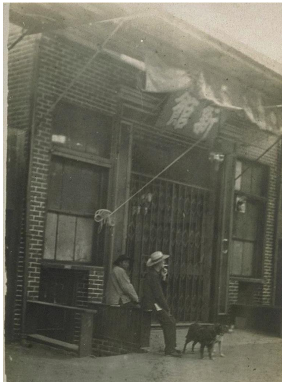
Figure 2.2 China Alley - Approximately 1910 152