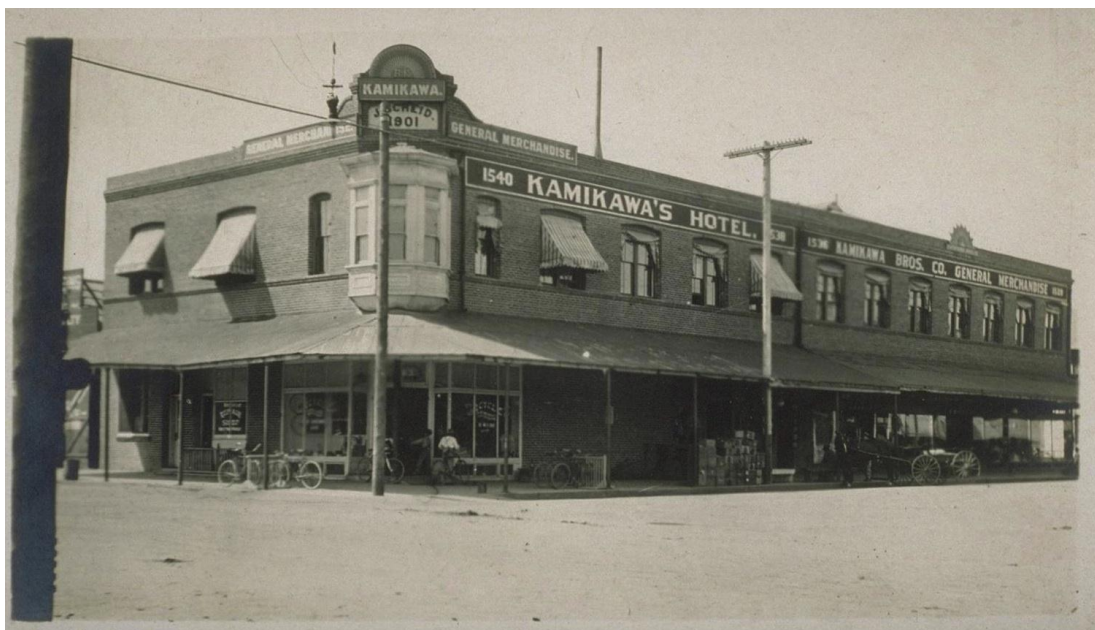
Figure 3.1 Kamikawa Business in Japantown, 1910s 239

The growth and permanency of the Japanese community in West Fresno was also reflected in the establishment of schools, temples or churches, and a hospital. 240 Several religious institutions were founded in Japantown: The Japanese Methodist church in 1894, The Buddhist Church in 1899, and the Japanese Congregational