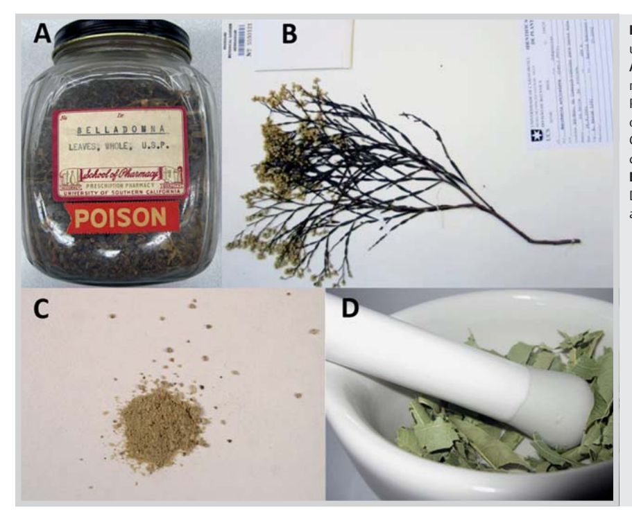
Fig. 1 Examples of the types of plant material used for isolation of DNA and authentication. A Bottle of Atropa belladonna dried leaves, originally from the University of Southern California Pharmacy School. Photo, A. M. Hirsch. B Specimen of Baccharis articulata from the Missouri Botanical Garden Herbarium. Photo, D. C. F. Moraes. C Powder derived from Hoodia gordonii . Photo, M. R. Lum. D Plant material of Baccharis genistoides prior to DNA extraction. Photo, D. C. F. Moraes. (Color figure available online only.)

ments and remedies, and Asia-Pacific and Japan make up the other important markets for these products [7].