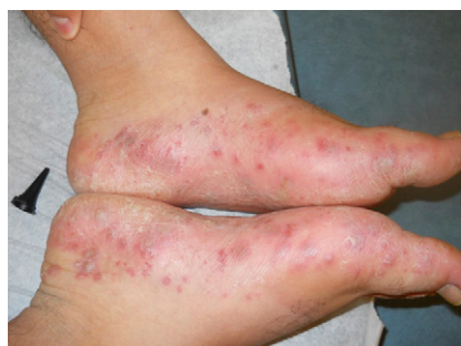
FIGURE 4 A 16-year-old with confirmed CVA6 infection who had purpuric papules and vesicles on the feet.

termed “eczema coxsackium,” (3) an eruption similar to Gianotti-Crosti, and (4) a petechial or purpuric eruption (Table 4).