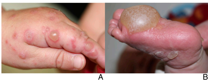
FIGURE 6 A 4-month-old (a) and 15-month-old (b) with confirmed CVA6 infection who presented with acral bullae.