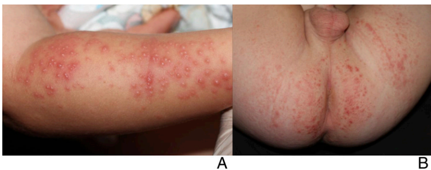
FIGURE 5 A toddler with confirmed CVA6 infection who had vesicles localized to areas of sunburn (a) in addition to perianal and buttocks erosions (b).