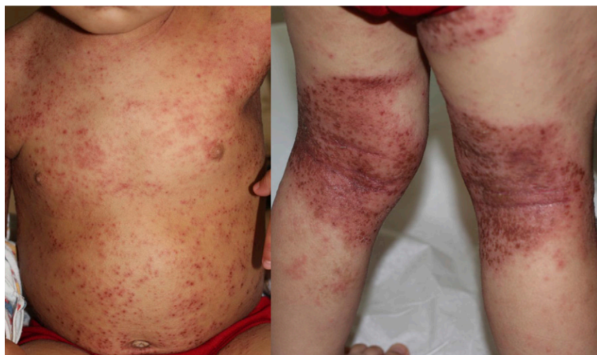
FIGURE 3 Eczema coxsackium: A toddler with confirmed CVA6 infection who had erosions localized to areas of AD.