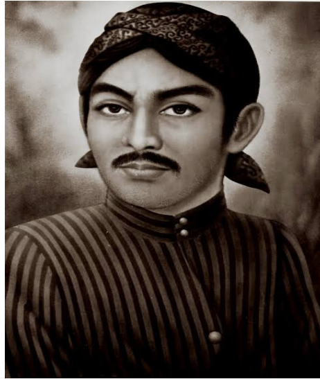
Photo : Sunan Kalijaga

The idea of this work is very simple that is inspired by Sunan Kalijaga. Sunan Kalijaga is an Islamic religious preacher in the Indonesian island of Java. sunan Kalijaga uses a syncretism approach in introducing and teaching Islam, he uses carving, wayang, gamelan, and suluk sound art as a means of da'wah and making a number of songs or Javanese songs. Simply put, the idea of this work is centered on the idea of syncretism which is inspired by the style of preaching Sunan Kalijaga, the concept of syncretism is very closely related to the idiom region involving traditional Javanese and western musical idioms. Materially this musical work mixes several elements of Javanese music and western music, such as the merging of the scale, the rhythm is then compiled with contemporary music styles.