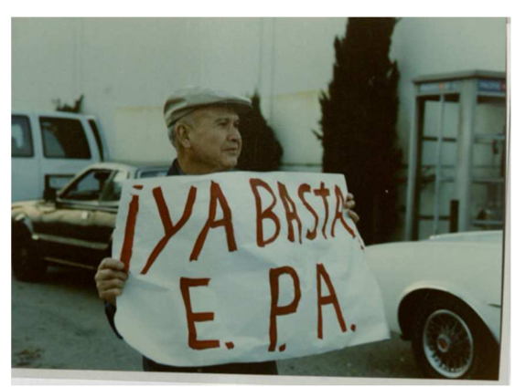
Figure 5. Protest Toxic Incinerator. 99

environmental measures that were considered and the community, both elders and youth, understood that the state was responsible.