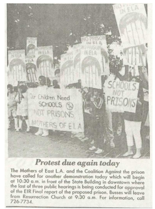
Figure 3. "Protest Due Again Today" in El Eastside Journal.

organization, but as an anti-prison movement. As revealed in the archive, this collective urgency manifested in meetings, interviews, rallies, and protests.