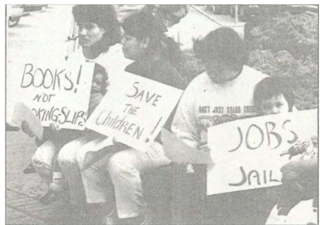
Figure 4. "Protestan contra cárcel en centrosur de L.A." in La Opinion. <sup>75</sup>

As a collective, MELA fiercely advocated for education where the State pushed for prison construction. During the protests against the prison, MELA members held signs that stated "schools not prisons" and "no to jails, yes to schools." By juxtaposing schools and jails, they illuminate how the state has historically prioritized the building of jails and prisons, over educational spaces like schools. In Figure 2, a group of young women along with their children are pictured carrying signs that read "books not booking slips", along with "save the children" and "jobs not jails." While schools are places where carcerality is reproduced, for MELA, it was clear that they saw access to education as a pathway towards a better life.