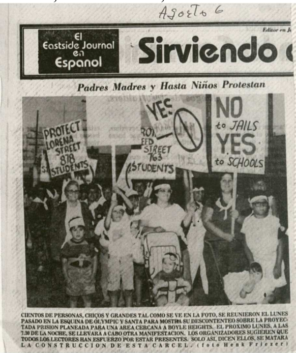
Figure 2. "Padres, Madres, y Hasta Niños Protestan," El Eastside Journal en Español . Courtesy of CSUN's Special Collections and Archives in box 9, folder 20. <sup>70</sup>

Collective Urgency: "No to Jails, Yes to Schools," "Protect and Save Our Children"