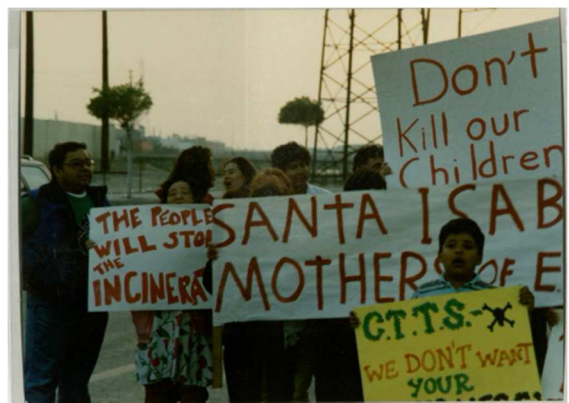
Figure 1. 51

Central to MELA's organizing was advocating for their children's survival. In doing so, MELA understood that their children's well-being was indispensable to their future. This is where the theme demonstrating collective urgency derives: from MELA refusing the states' proposals of violence and struggling against this violence is a rendering of collective urgency. For example, in figure 1, protestors are pictured carrying signs that state "DON'T POISON OUR CHILDREN," "The people will stop the incinerator," and "Don't kill our children." Here, MELA organizers understood that environmental racism could not be reduced to a civil rights violation, as Pellow writes, but rather a form of extermination. MELA acknowledged that children's lives were at stake, and it was up to them to demand alternative material conditions for future generations.