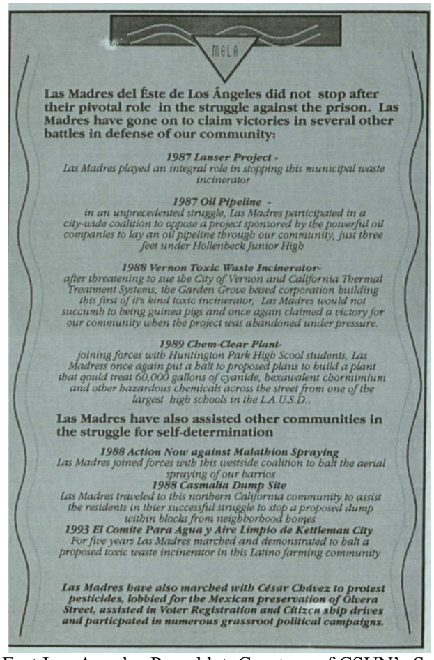
Figure 7 Mothers of East Los Angeles Pamphlet. 108