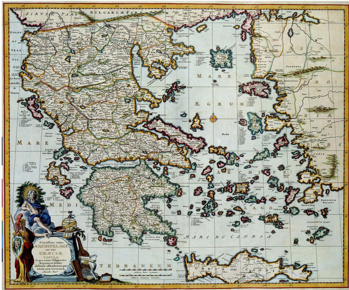
Figure 1. A map of the Aegean, by Nicolaus Visscher (1649–1702), published around 1681, illustrating a complex island region in which it is challenging to decide on archipelago or meta-archipelago membership from a biological perspective.

extend our analyses to encompass islands belonging to many sets of archipelagos (e.g., Bunnefeld and Phillimore 2012, Norder et al. 2018). This generates a further challenge, which is to determine the degree to which nearby archipelagos are truly independent ‘replicates’ as opposed to being interconnected by similar levels of information exchange as the islands within our archipelagos. As, increasingly, evidence of movement behaviours and of past propagation and colonization events encoded in phylogenetic data