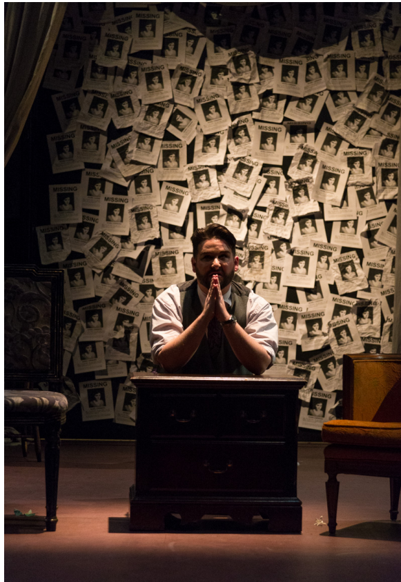
Figure 5: David, Lion in the Streets .