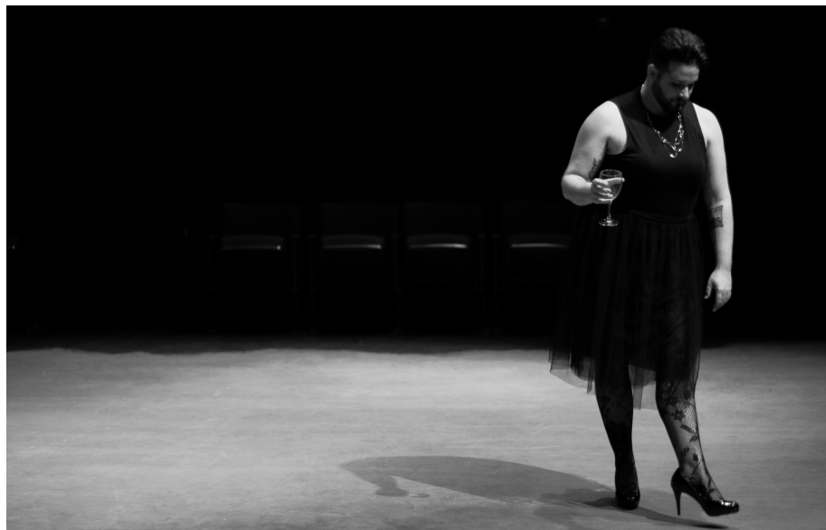
Figure 7: Lily, Lion in the Streets .