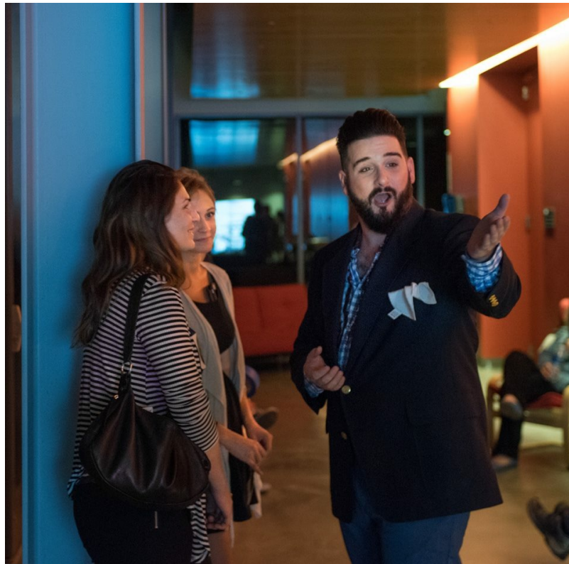
Figure 3: Antinous, The Odyssey .

These are visual representations of the characters I created during my two case studies. I've chosen to include them for the reader to see a visual representation of how different characters came to be. Of course theatre is visceral and should be experienced live, but for the sake of the readers imagination I believe they help to illustrate all of the characters I used as research for this thesis.