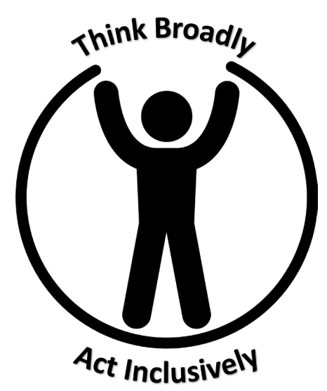
Figure 2 Educating ourselves for the public's health.

seem predestined to enter medical specialties based on concerns of privilege rather than community needs.