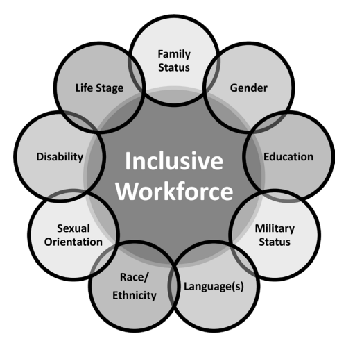
Figure 3 Toward workforce diversity and inclusion in family medicine. Adapted with permission.<sup>6</sup>

Academic family medicine and its related professional organisations have responded in part by forming committees and task forces addressing issues such as diversity, equity, inclusion, antiracism and belonging in all aspects of an organisation's mission. However, there is no 'one size fits all approach' that can be applied to family medicine organisations. The following suggestions are things