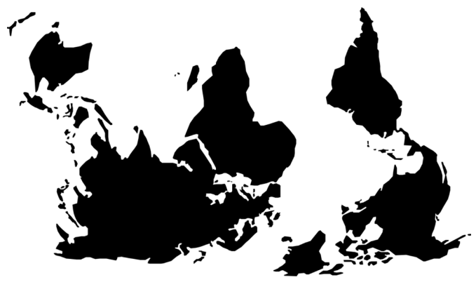
Figure 5 Can you see the world 'upside down'?

For physicians from the USA and other economically wealthy countries, global family medicine means looking beyond their training in increasingly fragmented professional cultures that neglect the basic tenets of primary care, community health, social accountability and the