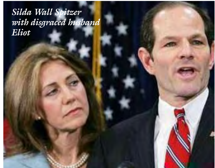
Silda Wall Spitzer with disgraced husband Eliot

vitality, and economic productivity to optimize a state of life. But it doesn't affect all groups equally: the vigor of dominant groups such as political celebrities rely upon exposing to physical or political death those groups that are constructed as threatening. Apostolidis argued that immigration is one biopolitical site that enables the recuperation of political figures' public lives and illuminates the muted contours of race in sex scandals. Historians have understood anti-immigration sentiment as fueled by the perceived threat of a degenerate population polluting the cultural purity and reproductive future of the nation. This older discourse of moral degeneracy haunts contemporary immigration debates. Unprecedented incarceration, detention, and deportation of immigrants signal that the specter of moral degeneracy has returned in the guise of protecting national security. Fears over undocumented women's reproductive excess and so-called "anchor babies" (American-born children who could insulate their mothers against