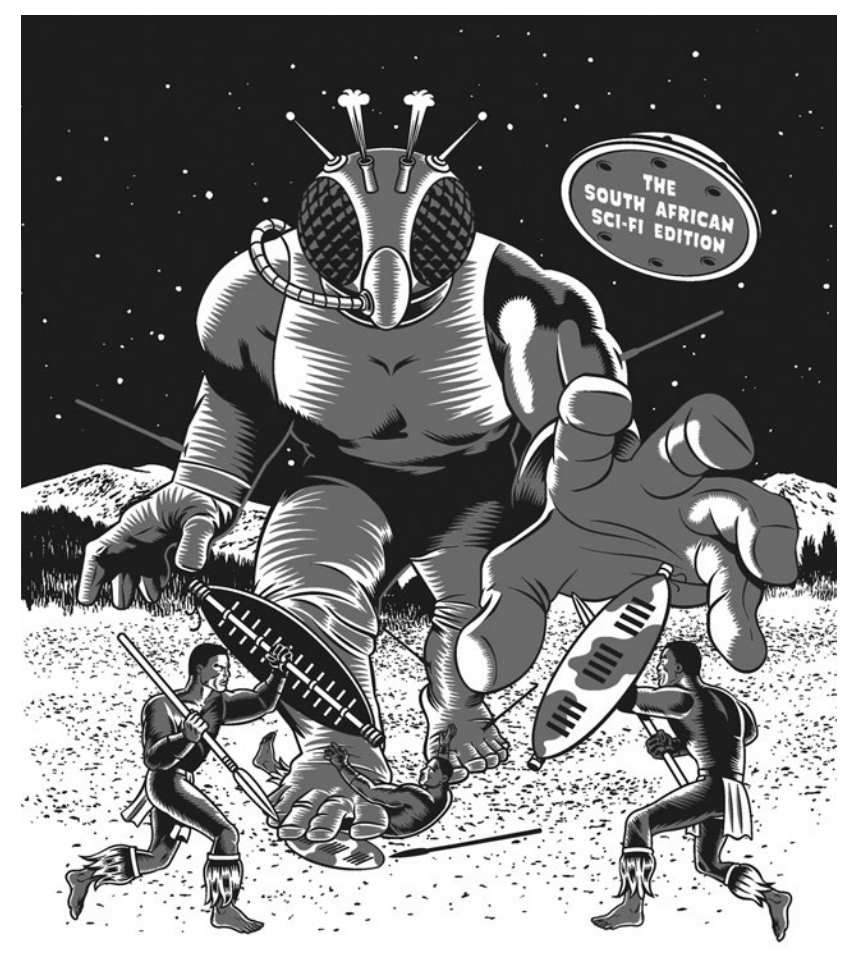
Fig. 6. Jungle Jim 16: The South African Sci-Fi Edition.

In these respects, it resembles precolonial Africa: "The Commonwealth was wealthy. 'Is this how the nations of Africa on the ancient Home Planet felt when they learnt that their lands were about to be invaded?' [Dr. Ama Agos] wondered out loud."<sup>168</sup> To survive, Agos and Kadzeka use a form of resistance that dates to the precolonial period. Deciding to make it appear as though the Commonwealth has already been subject to a radioactive attack, Kadzeka muses, "It is said that one way the smaller nations could dissuade invaders was to spread rumours of cannibals or monsters."<sup>169</sup> Agos "smile[s], savouring the visualization of the Commonwealth appearing on any charts from outside the system as FORBIDDEN, or better, HERE BE CANNIBALS."<sup>170</sup> In calling this collection