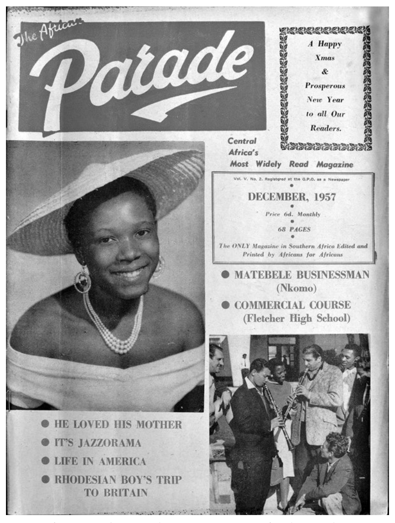
Fig. 2. African Parade, December 1957.

lighted Parade's status as "The ONLY Magazine in Southern Africa Edited and Printed by Africans for Africans" (fig. 2). Parade's emphasis on its African editorship and production was reiterated on the Nyanja page in the magazine's first issue: "IYI NDIYO MAGAZINE YOYAMBA NDIPO IRI YOKHA KUNO KUMWERA KWA AFIRIKA IMENE IMASINDIKIZIDWA NDI AN-THU AKUDA KUTI IZIWERENGEKA NDI ANTHU AKUDA" ("This is the first and only magazine here in southern Africa printed by black people so as to be read by black people").17 Claiming not only Central Africa but