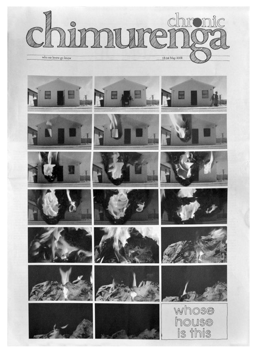
Fig. 5. Chimurenga 16: The Chimurenga Chronic.

illusion purposefully flattens the image to two dimensions. Across the twenty images, the house is swallowed by the gaping, burning hole in the newspaper and is eventually reduced to a pile of singed paper, to ash, next to the words "whose house is this." In this way, the cover foregrounds the materiality of the Chronic, asking readers to think about it