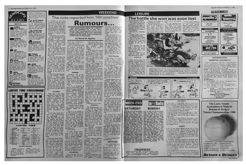
Fig. 4. Malawi News, Weekend Leisure, October 8-14, 1988, 6-7, featuring "Rumours . . ." by Norah M. Ngoma. Courtesy of Blantyre Newspapers Limited. Photo by Sam Banda Jr.

Lungu's story bears evidence of Banda's continuing tight grip on the media. Its moral about the consequences of believing rumors echoes Banda's warning to women regarding the evils of gossip. The story also uses fictionalized place-names to avoid the appearance of writing—or spreading rumors—about actual persons or events, a necessity