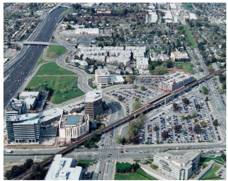
Figure 5-1. Pleasant Hill BART Station and Surroundings

This station is located in Contra Costa County and is surrounded by the communities of Pleasant Hill, Concord, and Walnut Creek, which allows for the investigation of the devices in different jurisdictions. There is limited bus and shuttle service in the area, and the devices could serve as an efficient feeder service from BART to the offices. Employers in the Pleasant Hill Area are located near retail and commercial businesses, providing a mixed-use location to test Segway HT use during the day. In Pleasant Hill, there are also opportunities to expand to the residential population, who could use the Segway HT as a commuter device on evenings and weekends in a subsequent field test phase. Finally, a trail system exists that connects the BART station to local neighborhoods and employment centers, which can be used for traveling to and from the station.