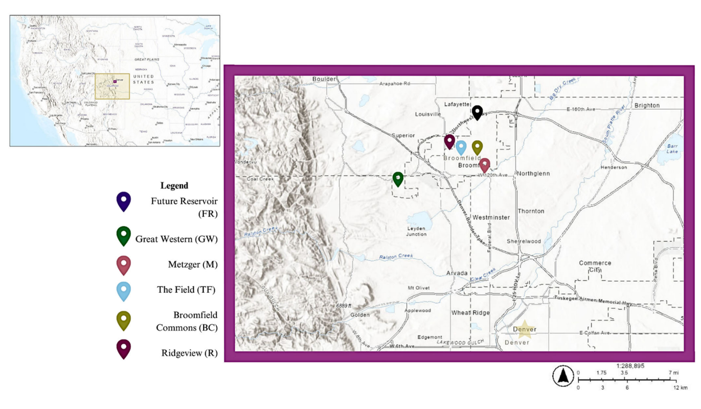
FIGURE 1 Map of field sites in Broomfield, Colorado, USA. Maps made in ArcGis (Esri, 2019).