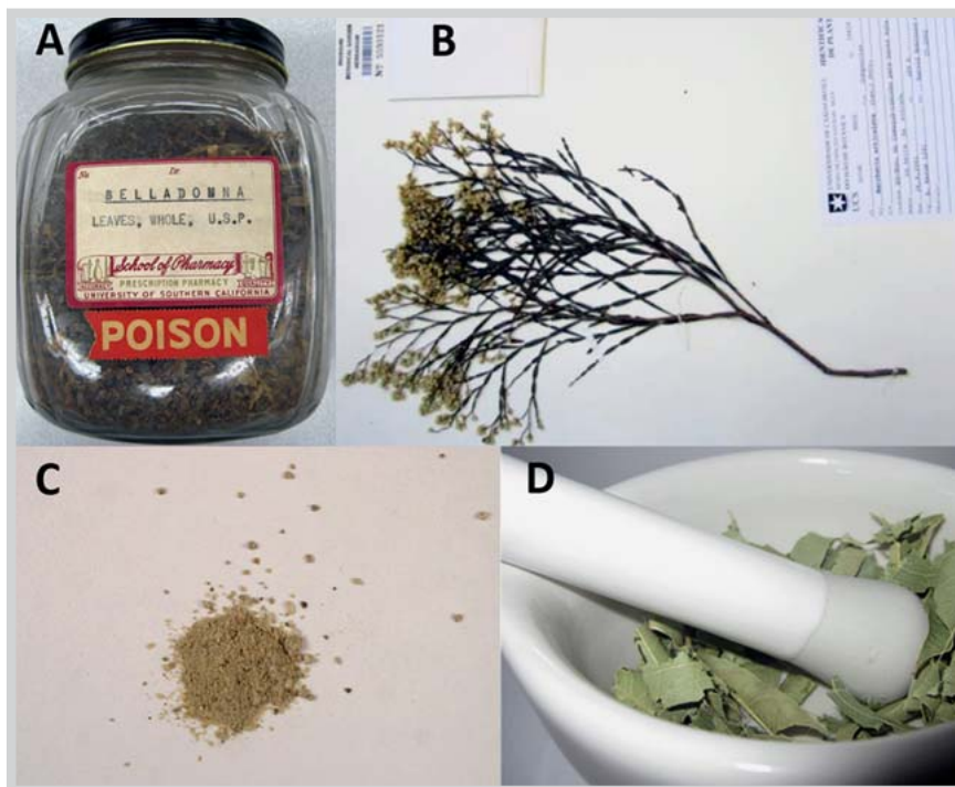
Fig. 1 Examples of the types of plant material used for isolation of DNA and authentication. A Bottle of Atropa belladonna dried leaves, originally from the University of Southern California Pharmacy School. Photo, A. M. Hirsch. B Specimen of Baccharis articulata from the Missouri Botanical Garden Herbarium. Photo, D. C. F. Moraes. C Powder derived from Hoodia gordonii . Photo, M. R. Lum. D Plant material of Baccharis genistoides prior to DNA extraction. Photo, D. C. F. Moraes. (Color figure available online only.)

ments and remedies, and Asia-Pacific and Japan make up the other important markets for these products [7].