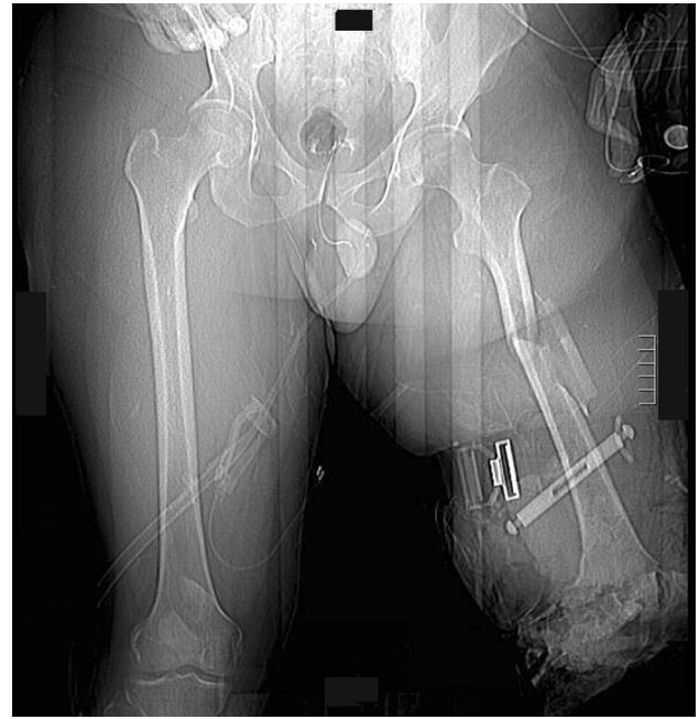
Fig. 2 Anterior–posterior scout image from computed tomography study obtained on night of admission showing left comminuted femoral shaft fracture, circumferential tourniquet around leg and traumatic through-knee amputation

allowed to retract. Debridement and irrigation of the open femur fracture were performed, and a uniplanar anterior external fixator (Smith and Nephew Inc., Memphis, TN) was applied. The soft tissues about the distal femur were debrided until clean margins were obtained, leaving the distal femoral condyle exposed (Fig. 3). A vacuum-assisted closure (VAC) device (Kinetic Concepts, Inc., San Antonio,