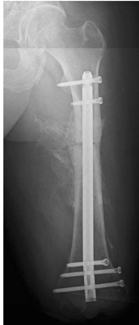
Fig. 6 Current anterior-posterior radiograph, 18 months following the acute femoral shortening procedure. Films show stabilization of the residual limb with a short interlocked retrograde femoral intramedullary nail

In the described case, sound amputation principles following trauma were utilized in concert with a novel approach to more proximal fracture management. Regarding limb length, amputation through the proximal aspect of the femoral fracture in this case would have resulted in a residual limb subject