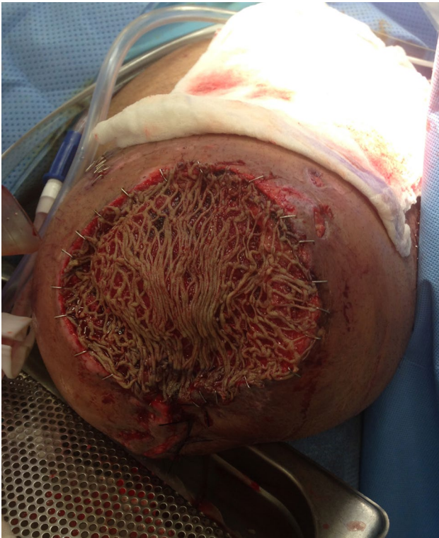
Fig. 5 Intra-operative photograph showing complete debridement of nonviable superficial tissue about the residual limb and split-thickness skin grafting over the distal aspect of the limb, placed on the reattached quadriceps and hamstring muscles

to decrease with more proximal amputations [8]. A recent systematic review and meta-analysis of the available literature have also reported lower quality of life outcome scores as amputation level became more proximal from below knee amputation to TKA and TFA. The authors concluded that limb length should be maximized when amputation is indicated based on the improved quality of life observed [9]. Raichle et al. [10] showed that patients with a more distal amputation level were also more likely to wear a prosthesis as well as use it regularly.