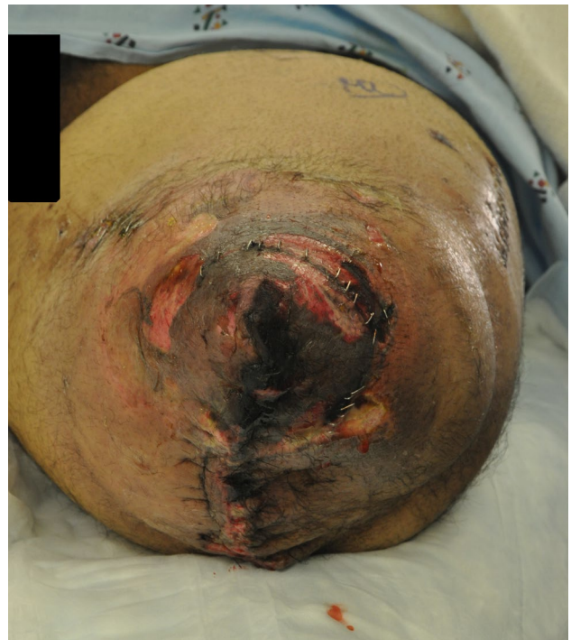
Fig. 4 Clinical post-operative photograph demonstrating initial closure of soft tissues about the injured limb after acute femoral shortening. Note the superficial soft tissues which remained compromised due to the crush and thermal injury

The patient was followed in the outpatient clinic; all sutures and staples were removed at 4 weeks. After wound healing and maturation had occurred, the patient began prosthesis fitting. He demonstrated excellent control of the limb with no evidence of abduction drift or hip flexion