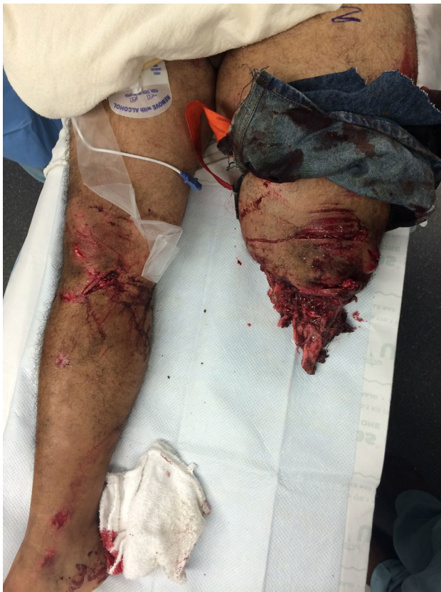
Fig. 1 Clinical photograph from trauma resuscitation bay showing appearance of left limb. A circumferential tourniquet is still present on the left limb and the presenting condition of the traumatically amputated limb can be seen

In the operating room, the tourniquet was removed and the injury zone explored. The popliteal artery was immediately identified and formally ligated. The remainder of the sciatic nerve was also identified and sharply transected and