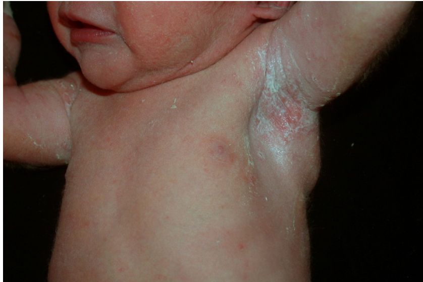
Figure 1: Macular and papular skin lesions covering trunk and extremities.

Our case raises awareness that a CCC infection can be transmitted from an apparently healthy mother without risk factors. Our patient's mother showed no evidence of abnormal vaginal discharge or presence of candida in her cytological exam. Although the reason for developing this infection is unknown, it is suggested that CCC may be facilitated by subclinical rupture of membranes before delivery [5]. If this condition is recognized early, unnecessary testing and overtreatment of newborns who present with these symptoms can be avoided.