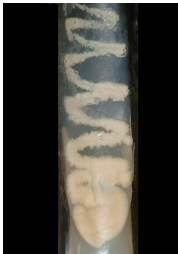
Figure 4: Isolation of Candida albicans on Sabouraud agar with cycloheximide.