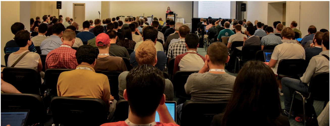
Figure 1. A full house at BOSC 2017.