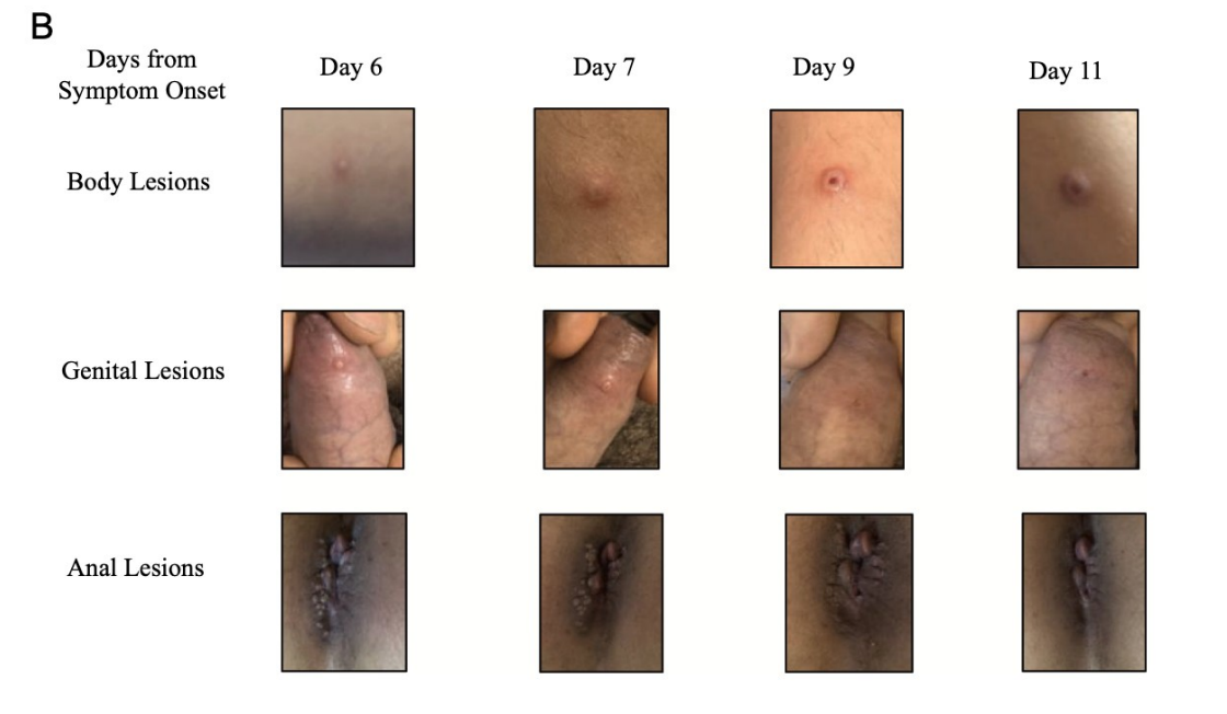
Fig. 2. A: Classic Presentation of Monkeypox (DRC, 1997). B: Monkeypox 2022 Clinical Presentation. Daily progression of lesions, which began 1-3 days after the prodrome (Italy, 2022). Pictures used with permission from Emanuele Nicastri, MD, PhD.

CDC PHIL: Centers for Disease Control and Prevention Public Health Image Library