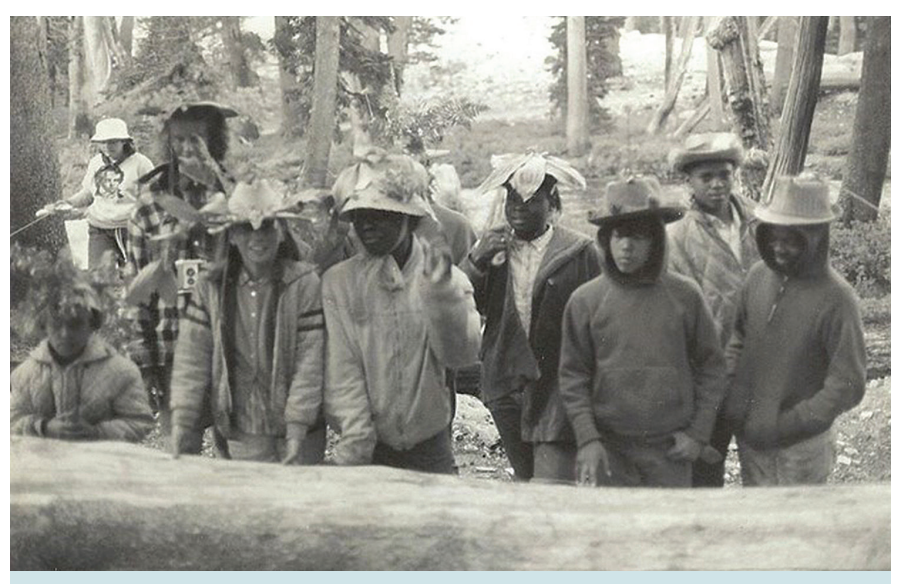
Outward Bound Adventures participants on 10-day backpacking trip to the High Sierras, circa 1964–1965.

Minorities in Agriculture, Natural Resources, and Related Sciences (MANRRS) started as a small group of minority students from the College of Agriculture and Natural Resources at Michigan State University. Out of its networking activities stemmed the first leadership conference of MANRRS in 1986 and a national conference has been held annually since then. Today, more than 60 colleges and universities have MANRRS chapters and natural resource agencies nationwide have been able to recruit students who have participated and competed for permanent employment. In the late 1980s, a group of educators and cultural and community activists created the Three Circles Center for Multicultural Environmental Education