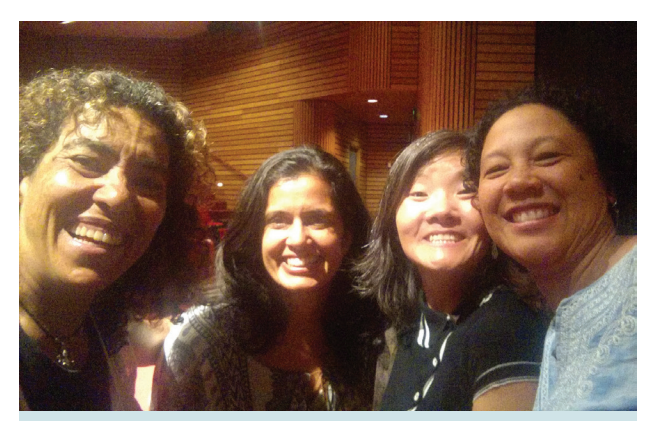
Participants at the PGM ONE Summit, Berkeley, CA, 2019

There are many more angles that could be included to help connect more dots. For instance, while exposure, experience, and experiential learning in