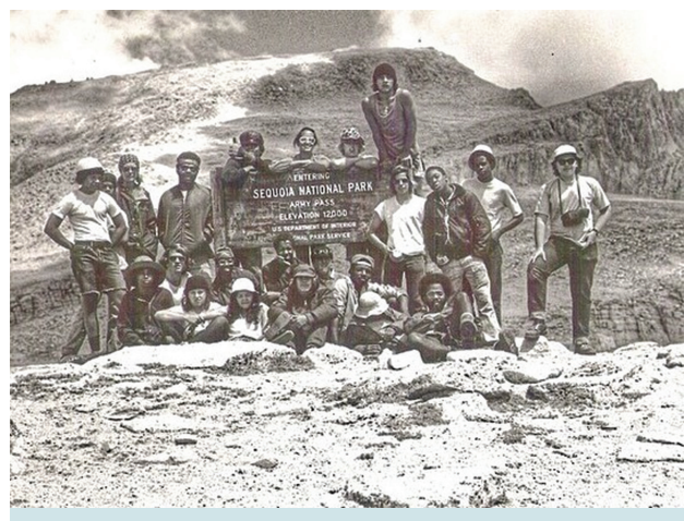
Outward Bound group at New Army Pass, Sequoia National Park / Inyo National Forest, circa 1970s

First, let's ensure that we continue to create and sustain a just, equitable, diverse, and inclusive movement that protects our national parks and public lands. Second, let's encourage this by acknowledging that people of color have played pivotal roles in park use and defense from the Buffalo Soldiers who patrolled Yosemite and Sequoia National Parks in the early 1900s to the organizing and activism of the Roundtable Associates and the National Hispanic Environmental Council. Additionally, it is also essential to recognize the Congressional Black and Hispanic caucuses, who, in the 21st century, have two of the best environmental and pro-national parks voting records in congressional history. Third, it is vital to disdain the idea that parks are, or need to be, at the center of everyone's universe by engaging those perceived to be the "uninitiated" in a respectful manner that does not invalidate their personal choices and preferences. We, park advocates, need the passion, commitment, and stewardship of people of color