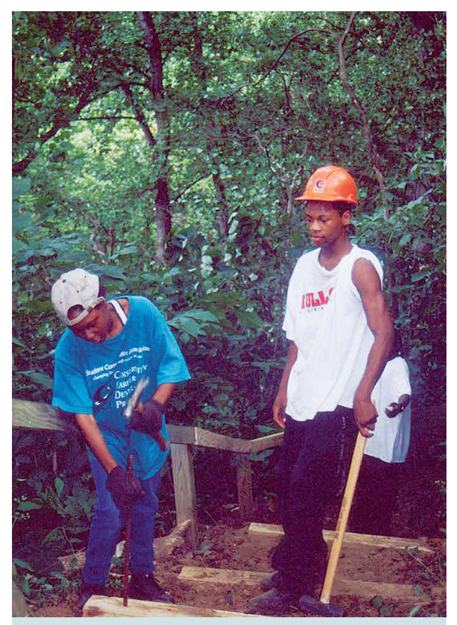
Students in SCA's Conservation Career Development Program learning to build steps on a trail .

WOW (Wonderful Outdoor World), established in 1995, is one of the first programs to introduce