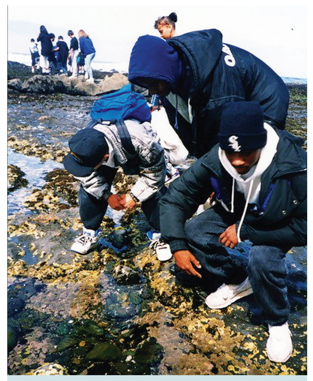
Young Brothers from East Oakland enjoy tide pooling at Point Reyes National Seashore, circa 1990.

in the late 1990s created an ability to exponentially spread messages, tell our stories, and promote our programs to communities of interest (e.g., people of color, LGBTQIA, people with disabilities). And with these technological advances, this platform brings with it an opportunity for race-specific affinity groups, among others, to band together because they can, and because they want to. For example, the new kids on the block, such as Outdoor Afro, Latino Outdoors, Outdoor Asian, and Natives Outdoors, seek to serve a very specific typology and are a welcome commodity! We applaud their leadership, growth, and increased visibility. They play a vital role in national progress and change (see diversifyoutdoors.com for other examples). Additionally, each of these organizations has a different history in the outdoors, so some of their nature-based activities that connect them to their past, their families' cultures, or ancestors, for instance, will reflect their outdoor practices differently. While many organizations of the past also served specific communities of interest, others sought to engage a broad cultural constituency, partially because there was a smaller proportion of people of color to reach.