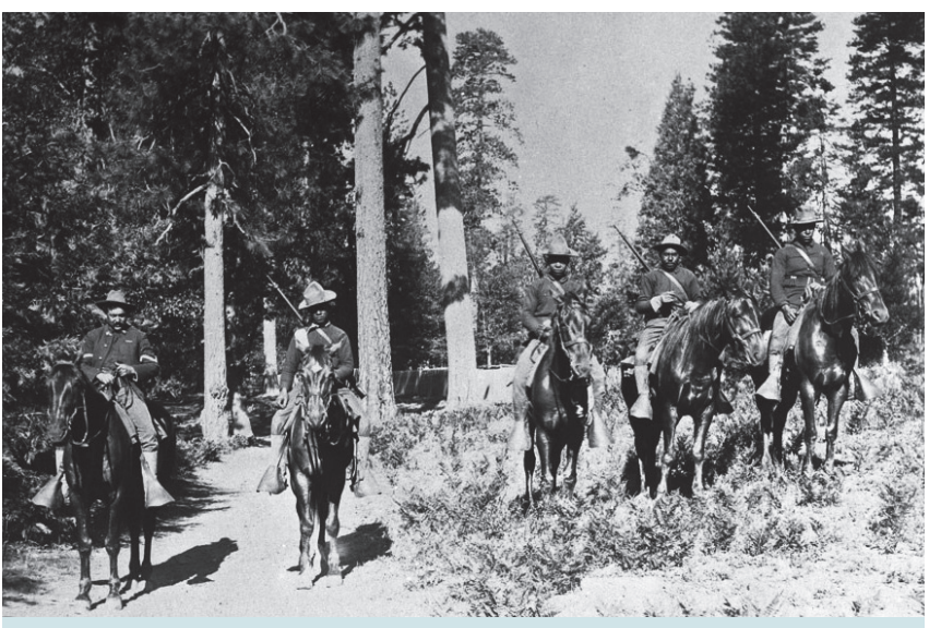
Buffalo Soldiers in the 24th Infantry carried out mounted patrol duties in Yosemite National Park, 1899.

On the federal government level, we acknowledge the history of segregation on public lands and conflicts that sometimes arose among, and between, users and land managers as a result of