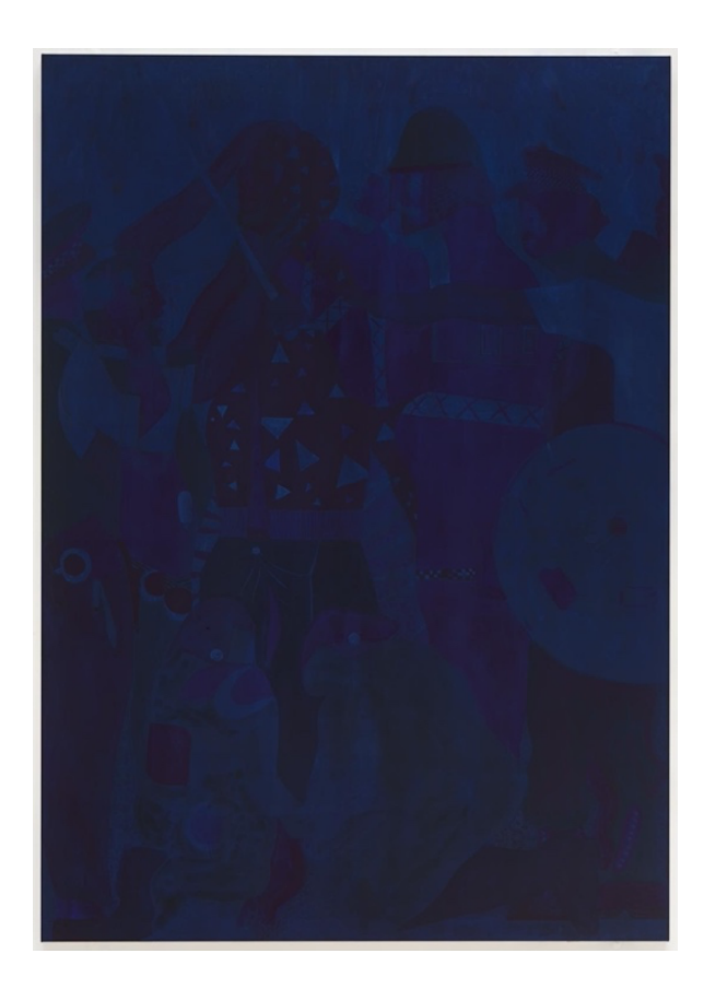
Fig. 1, Ofili, Chris. Blue Devils, 2014.

In his essay "Blue Vespers" in Black and Blur , Fred Moten explores Ofili's series of blue paintings displayed in the New Museum retrospective. For Moten, these paintings are "not series the way they want to make you think about it."<sup>3</sup> Rather, Moten sees Ofili's seriality as a ritualistic act of return that calls us to prayer. Moten links Ofili's use of the color blue with this prayer-like seriality.<sup>4</sup> With the paintings' blue pigment and their move toward darkness, the blurring haze of twilight makes it so that you can't quite settle, you have to keep moving, nothing is fully grasped. For Moten, both seriality and blue lack any discernible spatiotemporality. This is part of what make them so generative for Moten's considerations of blackness. There is no beginning, no ending, no arrival. Moten describes blue as that which has no place, it is something we are in already and that we are already—an "echoic atmosphere."<sup>5</sup> Similarly, the work of seriality's devotional refrain is "to have arrived at nonarrival."<sup>6</sup> As Moten sees it, for Ofili to linger in and return to this (non)place of seriality, to refuse to arrive, "such refusal is devotion."<sup>7</sup>