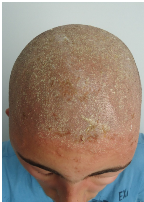
Figure 2. Erythematous, edematous, papulopustular and infiltrated skin on scalp

Following informed consent, patch tests were performed with the European Standard Series and pure henna after 4 weeks. The results of patch tests were evaluated after 48 and 72 hours. At 72 h, a strong reaction (+++) to PPD characterized by intense erythema, infiltration, and vesicles was noted. In addition, a weak reaction (+) to benzocaine, black rubber mix, and thiuram mix was documented. A negative reaction to pure henna was observed (Figure 3).