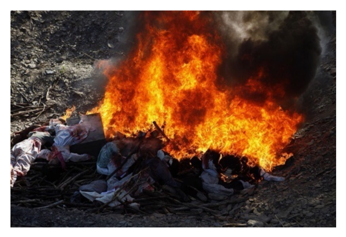
Figure. 4. Dead comfort women are burned in the fire by Japanese soldiers in Spirits' Homecoming (Jung-rae Cho, 2016)<sup>20</sup>

But a crime is still a crime, and the director had no intention of covering up the iniquity itself; he employs mise-en-scene as a tool to express and amplify the infringement of comfort women's rights done by the Japanese soldiers. To explore in more depth, the director's use of lighting also highlights the contrast between the bright, benign atmosphere prior to Japanese invasion and after the atrocities done to the young women by the Japanese Imperial Army. For instance, scenes when the young girls gather up and chitchat have lights with bright glow or clear daylight. There were also some occasions when the lighting of one scene, where Jeong-min meets a Japanese solider who hands her a map to assist her escape from the comfort station, is bright. Director Cho intentionally manipulates the lighting like this to convey what is good, if not