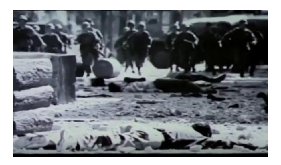
Figure. 7. 1980 Gwangju Democratization Movement where South Korean soldiers killed hundreds people, who opposed the country's takeover by the military, is represented in A petal (Sun-woo Jang, 1996)<sup>39</sup>

Unlike the many aspects of portrayal of women's suffering in Korean cinema, Spirits' Homecoming defies these standards and holds values of feminism, which further buttresses to both console the comfort women and gain favor of the female audience. One of the most distinguishable features and techniques was their camera work. As mentioned above, most films would depict women in a passive, male-dominated way; they are stared down by men which give a subconscious sense of superiority. Moreover, though it may not have been intended, there is a strange tendency of excessively exposing women's skin, creating an eerie, erotic atmosphere, which provides sexual pleasure to the male audience. Despite of all these trends, Spirits' Homecoming differentiates itself from other films about comfort women and depicts the suffering of women as it is. There is not a single scene in this movie filming unnecessary skin exposure of the young, comfort women. To be more precise, the camera never went past the collarbone and captures the breasts of the comfort women. The camera solely records the women