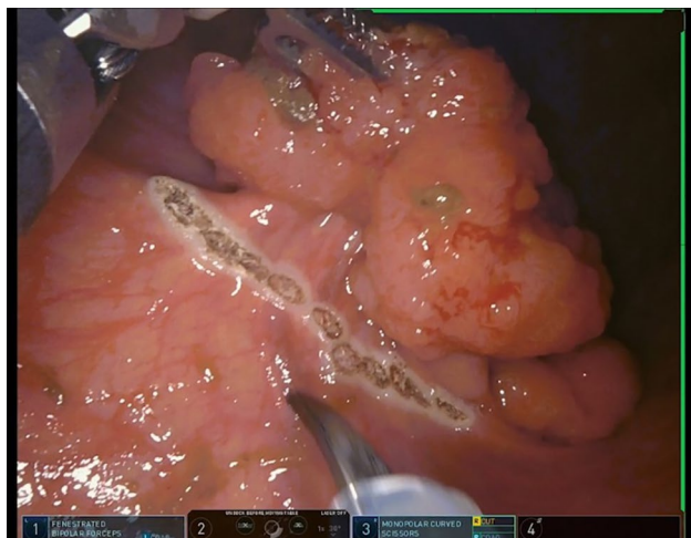
Fig. 4 The lesion is circumferentially outlined with a 1 cm margin using electrocautery

Placing a Raytec proximal to the lesion prevents effluent from coming down. The rectal lesion should be positioned inferiorly on the screen if possible to optimize wrist movement. The lesion is circumferentially outlined with a 1 cm margin using electrocautery prior to resection (Fig. 4). A