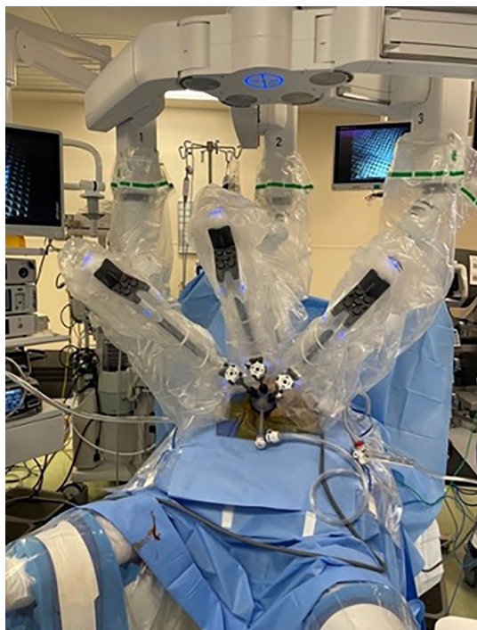
Fig. 3 Robot placement at the patient's side so that direct access to perineum in between the legs is maintained