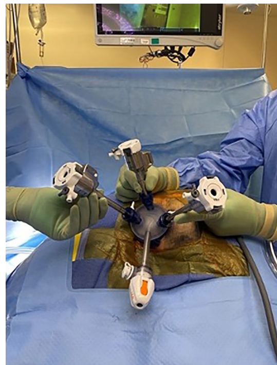
Fig. 2 Placement of trocars through the GelPort