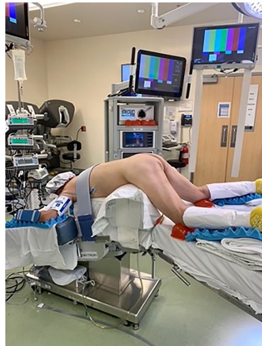
Fig. 1 A patient positioned in prone jackknife. This prevents the patient's legs from colliding with the robotic arms

We recommend general anesthesia to enable full muscle relaxation and rectal insufflation. A urinary catheter is not necessary. A single dose of pre-operative antibiotic is given. The optimal position is often prone jackknife. Positioning the patient in prone jackknife prevents the patient's legs from colliding with the robotic arms (Fig. 1). The GelPOINT path device (Applied Medical, Rancho Santa Margarita, CA, USA) is inserted transanally and sutured to the skin of the buttocks. The standard 8 mm da Vinci trocars are then placed through the GelPort (Fig. 2). A 5 mm AirSeal (CONMED Corporation, Utica, NY, USA) is also inserted, for insufflation and manual assistance by a bedside assistant. Use of the AirSeal helps maintain stable pneumoinsufflation of the rectum. The robot should be brought in from the patient's side, so that direct access to the perineum in between the legs is still available for the surgeon or assistant (Fig. 3).