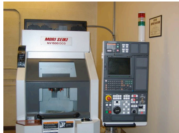
FIGURE 3: MORISEIKI NV1500DCG VERTICAL MILLING CENTER.

Machining will be performed on a Mori-Seiki NV1500DCG vertical milling center. The machine has the capability to computer-numerically-control machining in 3-axes.