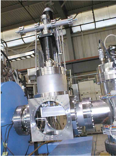
Fig. 1. The new emittance scanner head plus vacuum spool and feedthroughs.

A new emittance scanner device (Fig.1) has been installed in order to investigate the ion-optical parameters of the AECR-U injection beam line into the 88-Inch Cyclotron at higher beam-current densities.