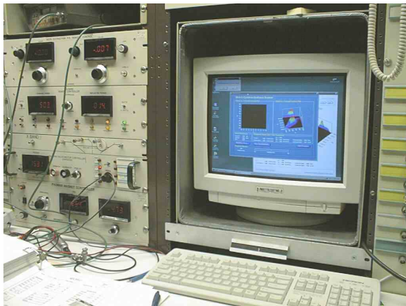
Fig. 2. The scanner computer control at the ion source control console.

An electrostatic-deflection-type emittance scanner has been chosen to allow fast on-line measurements while tuning the ion beam through the cyclotron, because it allows very fast data-sampling. One scan takes between one and two minutes, depending on scan resolution.