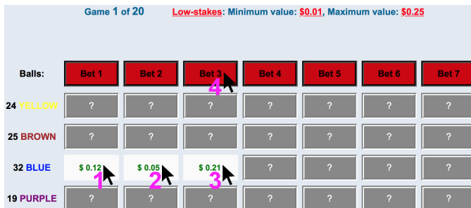
Figure 1: The Mouselab paradigm, showing an example sequence of clicks generated by the SAT-TTB strategy, which was discovered through approximate rational metareasoning.

operations. Intuitively, this means that the decision process prescribed by our model achieves the optimal tradeoff between decision quality versus decision time and mental effort. This tradeoff depends on the stakes of the decision such that higher stakes usually warrant more deliberation. Likewise, since processing probable outcomes is more likely to improve the quality of the resulting decision than processing improbable outcomes, we expect our model to prioritize probable outcomes over less probable outcomes—especially in high-dispersion trials.