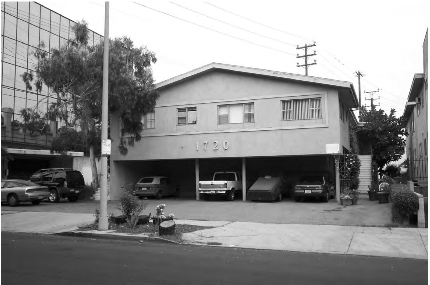
Figure 1. Off-street parking in Los Angeles.

Shifting the focus of parking requirements from quantity to quality will help planners to play a more constructive role in shaping the built environment.