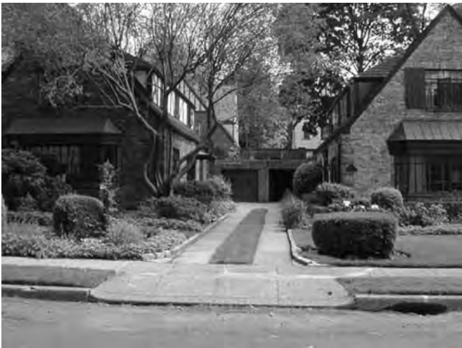
Figure 9. Shared driveway, Forest Hills.