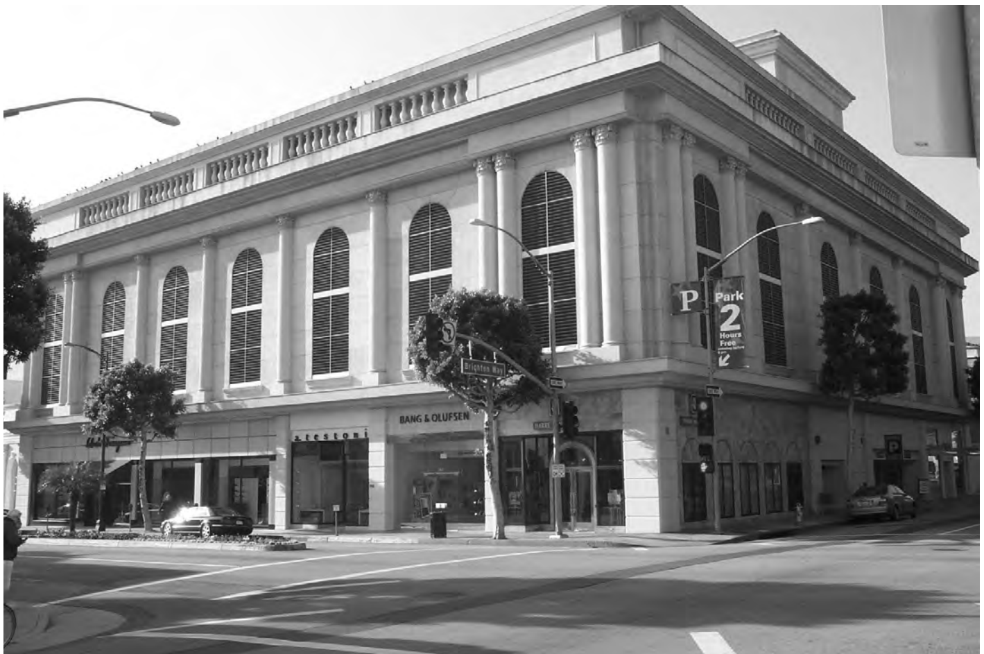
Figure 7. Parking structure with ground-floor retail, Beverly Hills.

Although we criticize the way planners now regulate parking, we do not call for deregulation. Instead, we recommend that planners use their ability to regulate parking more constructively, worrying less about the quantity of parking and more about its quality. Market