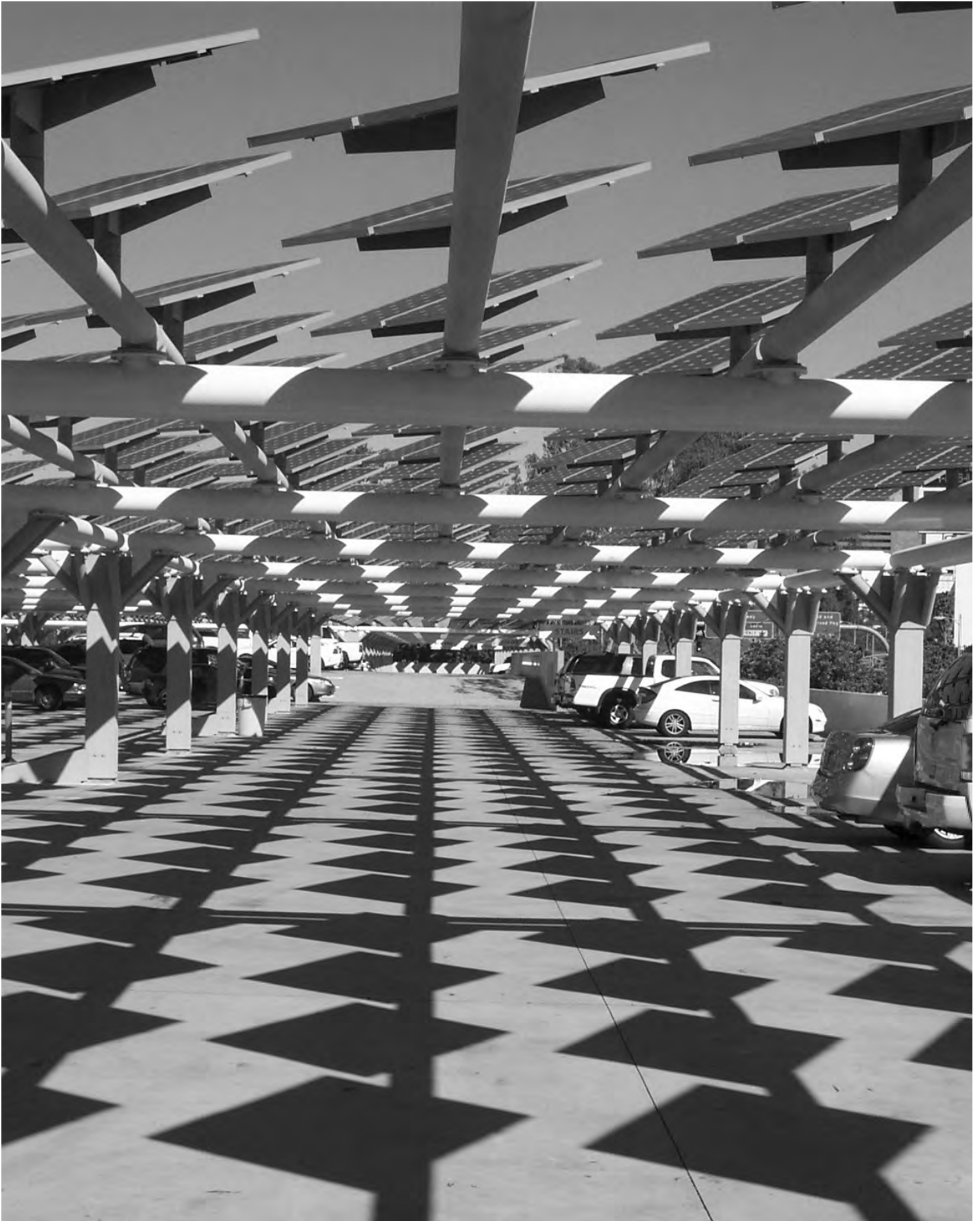
Figure 6. Solar collectors over a parking lot, Los Angeles.