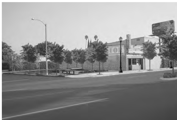
Figure 5. Parking lot without and with landscaping, West Hollywood. (Photo courtesy of Paul Travis).