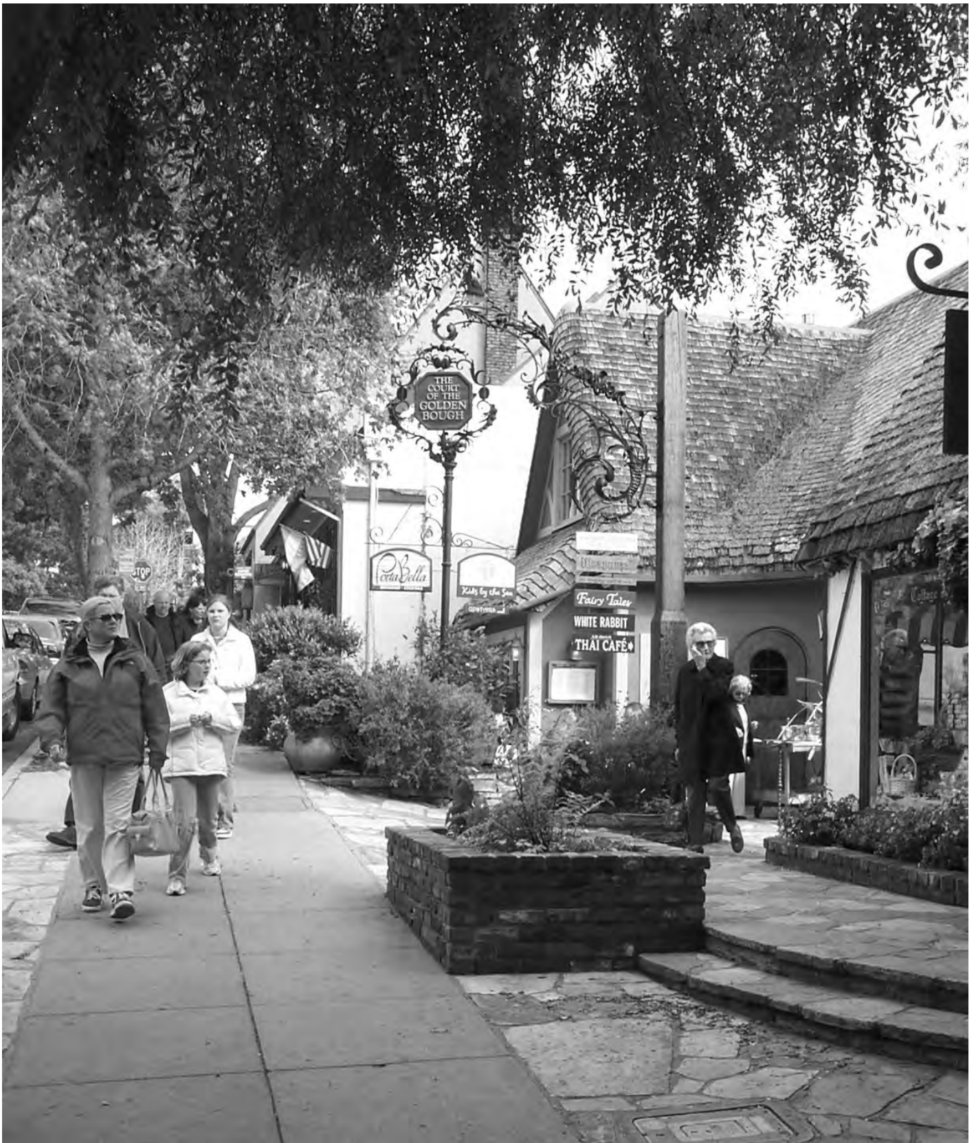
Figure 3. Walking in downtown Carmel.