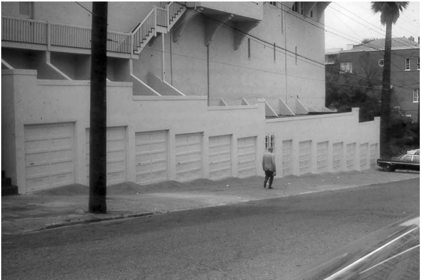
Figure 2. Off-street parking in San Francisco.

their downtowns to make them more accommodating to pedestrians. Other cities have reduced or eliminated parking requirements adjacent to public transit stops. An ordinance in Portland, Oregon states, “There is no minimum parking requirement for sites located less than 500 feet from a transit street with 20-minute peak hour service” (City of Portland, 2006).