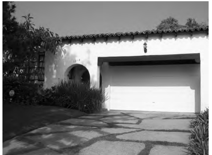
Figure 10. Recessed garage door, Los Angeles.