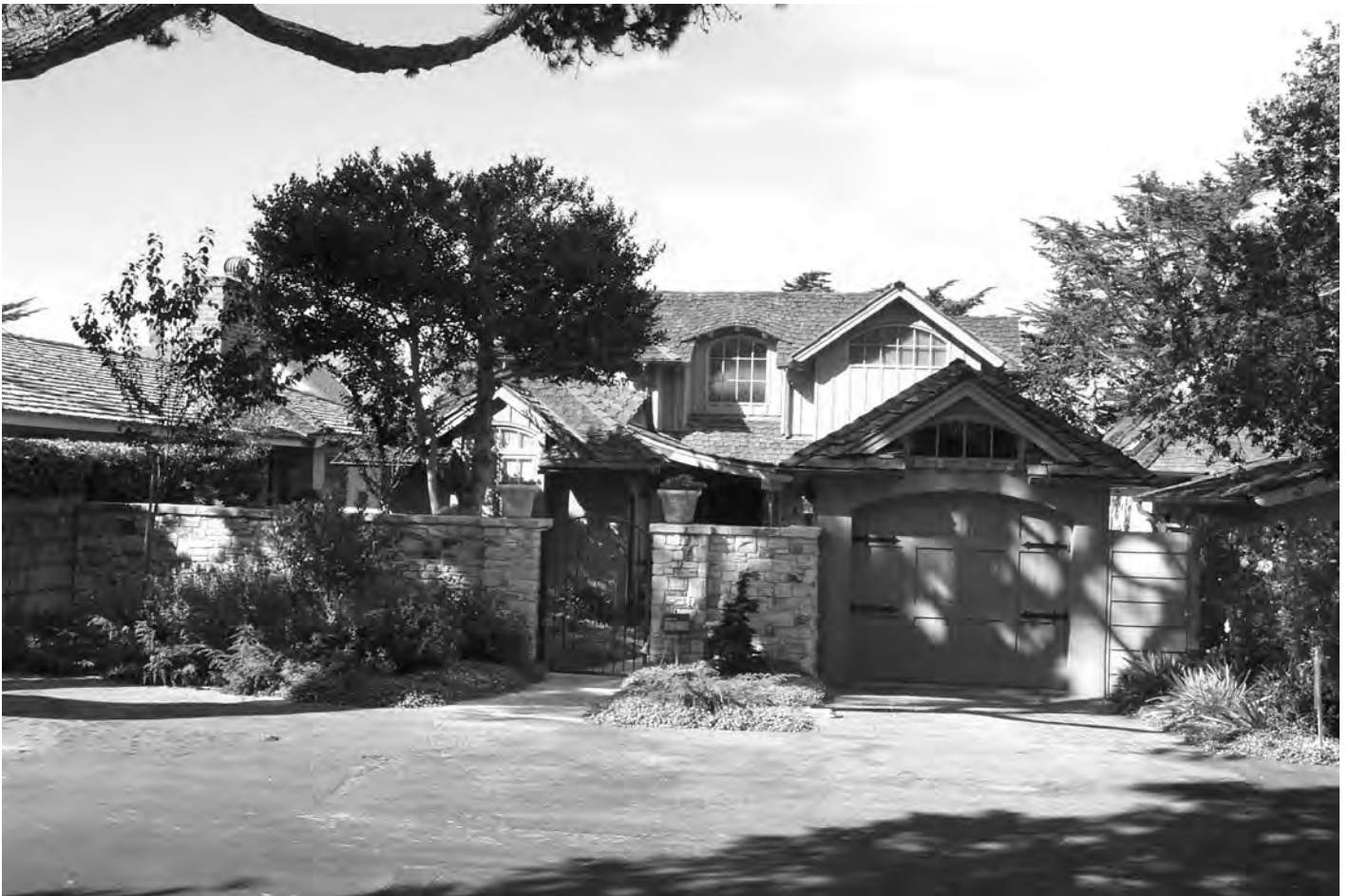
Figure 8. Single-car-width garage, Carmel.