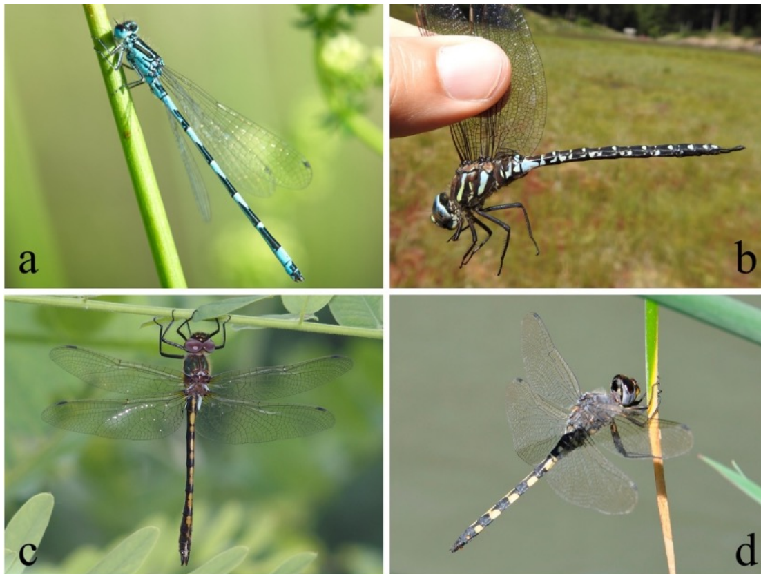
Figure 1. Representative Odonata: a) Coenagrion castellani – Trevi (PG), 03/06/2022; b) Aeshna subarctica – Altavalle (TN), 09/08/2019; c) Oxygastra curtisii – Calcio (BG), 11/06/2018; d) Zygonyx torridus –S. Caterina Menfi (AG), 14/08/2014.

the European odonatological fauna. Two species, namely the damselfly Coenagrion castellani (formerly known as C. mercuriale castellanii ) and the dragonfly Cordulegaster trinacriae , are endemic of Italy, while Ischnura genei is a subendemic species due to its presence in the French island of Corsica. Compared to the previous checklist (Utzeri and D'Antonio, 2005), 3 species ( Ischnura graeelsi , Cordulegaster picta , Epithea bimaculata ) should not be considered part of the national fauna anymore. Further occurrences of the species in national territory not included in the Supplementary file S2 will be included in future updates of the checklist. It is the case of Aeshna subarctica in Veneto, Cordulegaster bidentata in Molise, Somatochlora flavomaculata in Puglia, and Trithemis annulata in Piemonte, just to name a few of the cases of which the authors are currently aware.