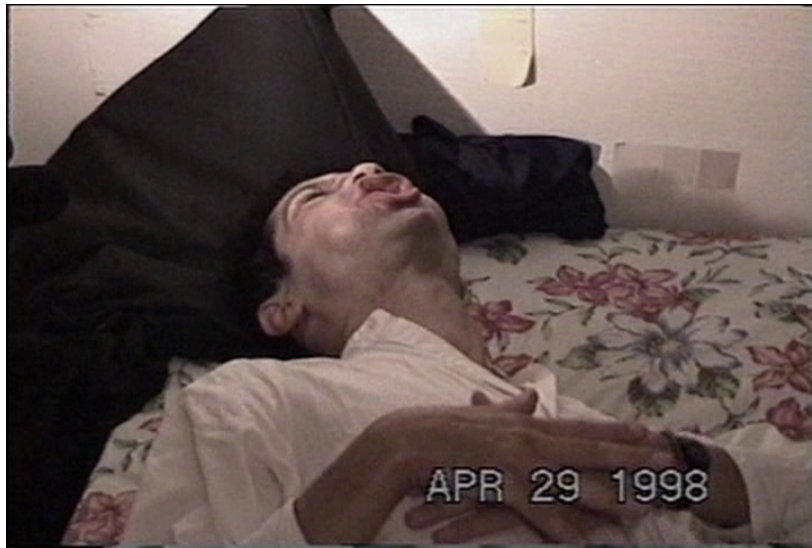
Figure 0.3: I Was Possessed 's documentation of a historical moment seen in the date/time stamp.

technologies that “introduced new signifiers of interiority,” 69 Akira Lippit references the possibilities promoted by the French Impressionists of the first avant-garde, the potential of photogénie to show an inner emotional life and thereby enhance reality. In this film, however, that dream of the cinema as a technology of interiority meets its match, for it is the exteriority of the camera perspective that is insistent. The images accumulate, excessively even, but in that excess no images of the inner experience are to be found. This is I Was Possessed 's avisuality, its mark of the apophatic. Divine possession, it turns out, is pretty dull for those on the outside.