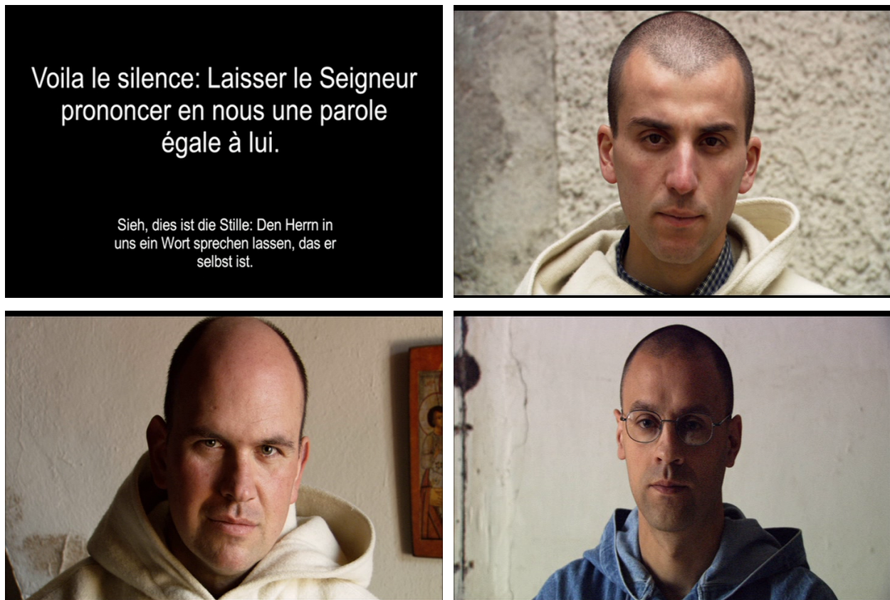
Figure 4.3: Negating the talking-head convention: evidence of the divine as a negation in the form of silence in Into Great Silence .

to speak one work in us...that HE is,” the title card reads, followed by three close-ups of 20 seconds, 20 seconds, and 10 seconds in length, of three silent monks.