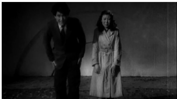
Figure 2.8: The unusual moment of direct address in Sign , inspired by Akira Kurosawa’s One Wonderful Sunday .

Sunday has a social realist style, reflecting its post-war Japanese milieu, with aesthetics comparable to the films of the contemporaneous Italian Neo-Realists and themes exploring the