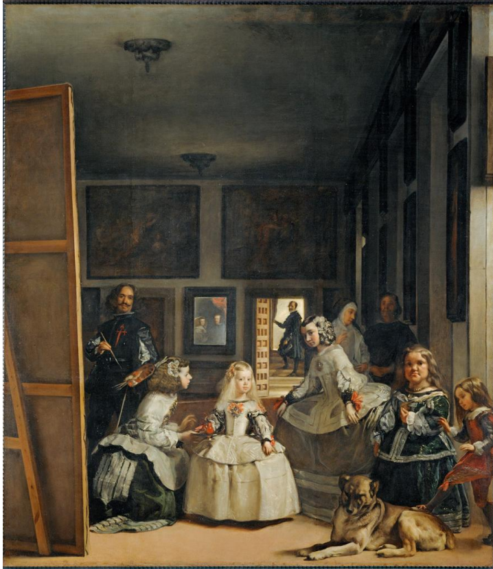
Figure 2.9: Creating a heterotopic space in Las Meninas as the space of the viewer, painter, and true subject of the painting are conflated in the space outside of the canvas itself. Diego Velázquez, Las Meninas, or the Family of Philip IV , 1656, Oil on Canvas, 276 x 318 cm. Museo del Prado, Madrid, Spain. Available from: ARTstor, http://www.artstor.org (accessed February 20, 2016).

together.” 80 Foucault’s prime example of a representational heterotopia is Diego Velázquez’s painting Las Meninas (1656); like Zahedi’s Vegas , the syntax here that is impossibly combined but not ‘properly’ held together is the syntax of the space between object and viewer.