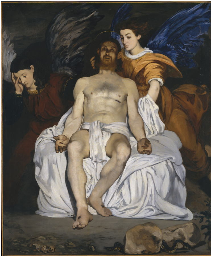
Figure 0.1: The deviations from this scene’s traditional iconography and the uncertainty of the state of Jesus calls for a religious-like faith from the viewer of the painting, de Duve argues. Édouard Manet, The Dead Christ With Angels . 1864, Oil on canvas, 70 5/8 x 59 in. The Metropolitan Museum of Art, New York, H. O. Havemeyer Collection, Bequest of Mrs. H. O. Havemeyer, 1929.

itself, de Duve argues in language that echoes Marion’s description of the icon. In painting a traditional religious scene but then filling it with negations of the traditional iconography and narrative, 41 Manet requires something of his viewers that the resurrection itself requires of a religious supplicant—faith. The painting “calls for something other than intellectual endeavor, questioning, and skepticism; much more to the point, it requires an open-mindedness that has as much to do with an openness of the body and the heart: letting oneself be touched emotionally and aesthetically by the painting and what it shows.” 42 Manet creates a parallel between religious faith and faith in the painter, de Duve argues, a shared experience regardless of belief.