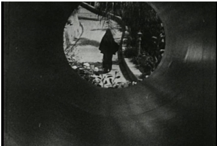
Figure 1.1: Giving the invisible visual form in Meshes of the Afternoon : visualizing the beginning of a dream by pulling the camera back through a tunnel.

Deren described the hierophanies of her pre-Haitian films in terms of their ‘inevitabilities,’ abstract driving forces that give the films their vitality. Meshes of the Afternoon has an inevitability that “is the function of the underlying drama” as the film visualizes a dream experience, while in A Study in Choreography for Camera , “the inevitability is entirely visual” as it creates an entirely non-narrative and uniquely cinematic dance performance through formal devices such as matches on action, overlapping editing, and camera movement.