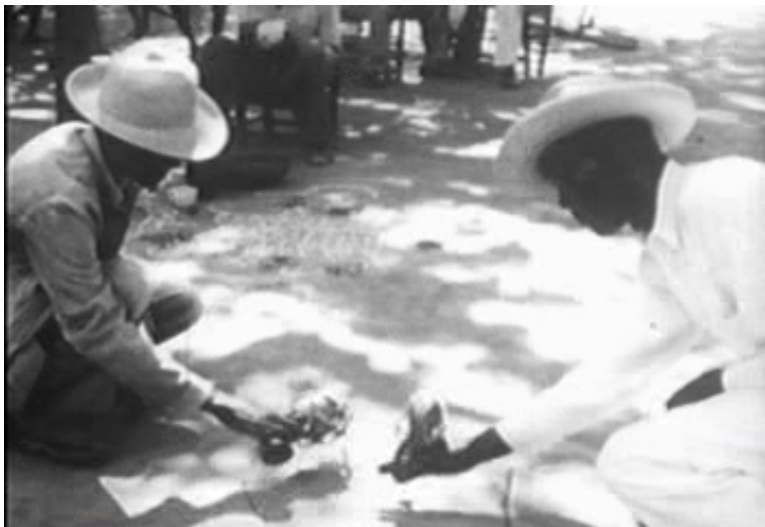
Figure 1.3: Trying to communicate both what is happening and what is being experienced in the Haitian footage. Here, priests shake their sacred rattles to call forth the gods from the land of the invisible, an elaborate ritual meaning that is not well communicated by the purely visual. Still taken from Divine Horsemen (1985).

The critique Jean-Luc Marion levels at the form of the idol, as necessary as it might be, is that it presents a limited, human-sized version of the divine. It is possible to read a similar, religiously motivated critique as influencing Deren's apophysis, as this action helps to preserve the religious power of the unrepresented possession dances. When watching Deren's raw footage, it becomes clear that there are two levels of information that the images are trying to convey, that which is happening (crowds gathering, animals slaughtered, dancing, etc.) and that which is being experienced.