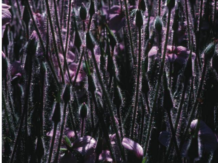
Figure 3.7: The discovery of color in Compline .

Other shots in the film emphasize this focus on color when the mystery of object identification is never solved, as in a brilliant emerald green object that stubbornly remains out of focus in the foreground of a shot early on in the film. This prevalence of color—never pure color fields but nevertheless unidentifiable as anything else—in Compline points to a necessarily invisible, and therefore within the representational system of the moving image, sacred, object of its representational focus; the literal ground of the film image, the celluloid film stock on which these images are chemically recorded and from which these colors are projected onto the screen.