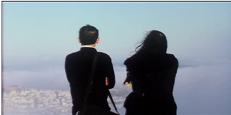
Figure 2.2: The vision-obscuring fog at the end of Sign , negating Caveh's exhortation to "look."

This theme of the difficulty of demonstrating the presence of the divine (or even a sign of that presence) is then reflexively turned to the viewer in Sign's final scene. After a desperate bid to find any sign from God, Caveh takes an off-handed comment by a passing fan for divine guidance that he and Laura should go to the top of a nearby hill. "Either everything means something or nothing does," he pleads with Laura and, it seems, the viewer, not unsympathetically. Despite having broken up with him, Laura agrees to accompany Caveh one last time. As they climb the hill, Caveh is constantly on the lookout for a sign. "Hey Laura, look!" he says in the penultimate line of dialogue, the focus on the revelatory power of vision reflecting his proposal in Vegas that the viewer "will see." The exhortation to "look" is seemingly directed at the viewer as well, as though here we will finally receive some validation of Caveh's insistence that everything means something.