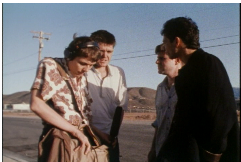
Figure 2.1: The crew stops to discuss the film in progress on the way to Las Vegas in Vegas.