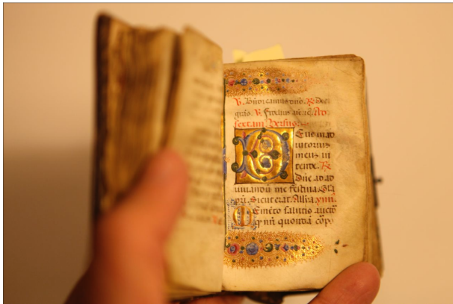
Figure 3.5: Books of Hours were designed to be carried throughout the day.

As a prayer book, the Book of Hours was designed for private devotion. Taking its name from the requisite inclusion of a set of prayers to the Virgin Mary established on the canonical hours and small enough to be carried throughout the day, the popularity of Books of Hours