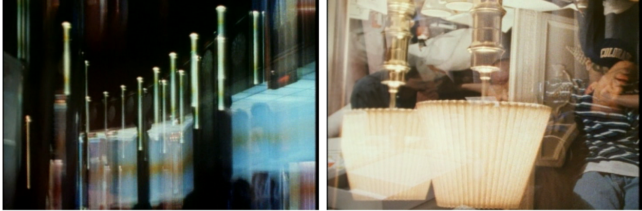
Figure 2.4: The mechanical limits of the image in Vegas as emphasized by a malfunction of the camera and the human failings of the filmmakers.

There is also a recurring motif of accidental silence in the film in which the sound recorder, separate from the camera, fails to capture the auditory half of the film image. In Vegas ' documentary aesthetic, in which the camera is recording the actuality of the world shared with the viewer, a successful cinematic 'image' is one that has both image and sound; an image without sound is just as much a missed opportunity to capture "the good stuff" as is sound without an image. In one instance the lack of sound serves as an indication of the absence of D, who is in charge of the sound recording for the production. In another, Greg purposefully does not turn the sound recorder on during his 'confessional' scene. Just before they leave Las Vegas, each character is set up, alone in the hotel room, in front of the recording camera and encouraged to say whatever is on their minds. Greg makes sure the sound is not recording and lays down on the couch, an act that was motivated, at least in part, by the attractive idea of adding a measure of silence to counterbalance Caveh's loquacious persona. 44 Finally, a title card tells us that all the sound recordings from the drive back from Las Vegas to Los Angeles were lost at some point post-production, effectively eliminating that entire trip from the film's realm of representation. In the hunt that was the film, all these events (and the time stamps tell up that 8 ½ hours passed for a 4-5 hour trip) were missed.