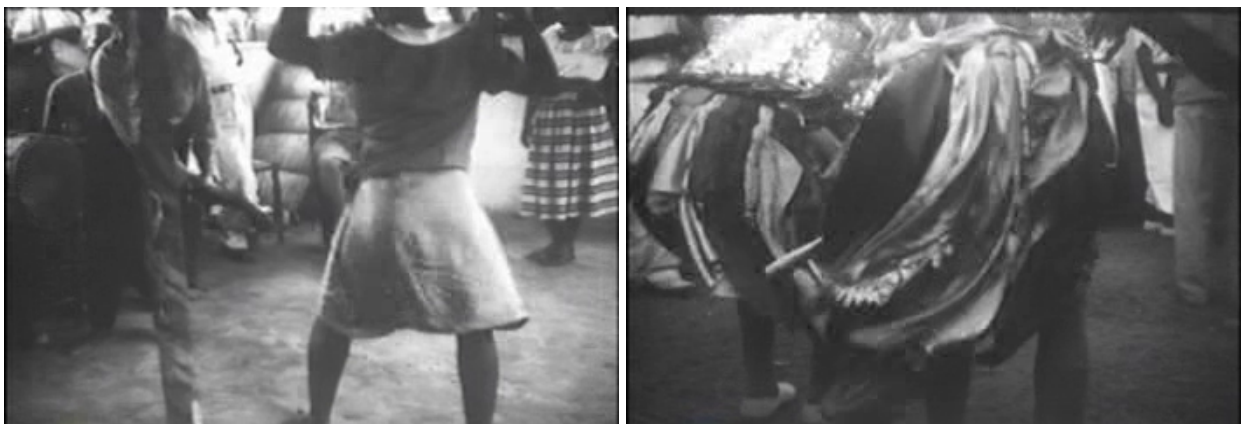
Figure 1.4: Subsequent shots in Divine Horsemen (1985) illustrates the visual sameness as a film image remains on the outside of the figures, obscuring the internal differences between possession and a paid performance.

In addition to filming Voudoun ceremonies in Haiti, Deren recorded six reels worth 93 of Mardi Gras performances and parades. Some of this footage makes it into the Ito documentary, and the way it is presented at once seems to exemplify Deren’s original plan emphasizing visual similarities across different contexts as well as makes clear the limits Deren found in such a structure actually conveying elements of culture. As edited in the documentary, from a possession dance exemplifying the erotic nature of some Voudoun dances, as the voice-over frames it, there is a dissolve from a shot of a possessed woman provocatively dancing in the direction of the camera to a graphic match of two figures in a seemingly identical dance.