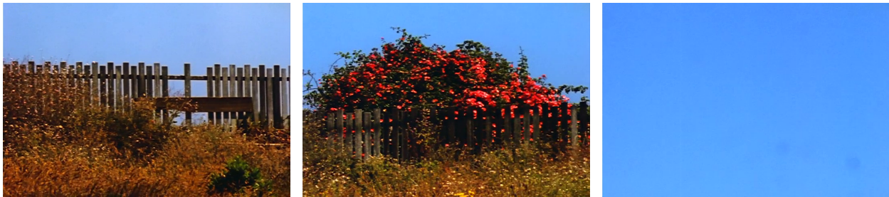
Figure 3.3: The muted vegetation at the beginning of All My Life , one of the rose bushes that the slow pan to the left reveals, and the ungrounded sky at the end of the shot following a final tilt up.