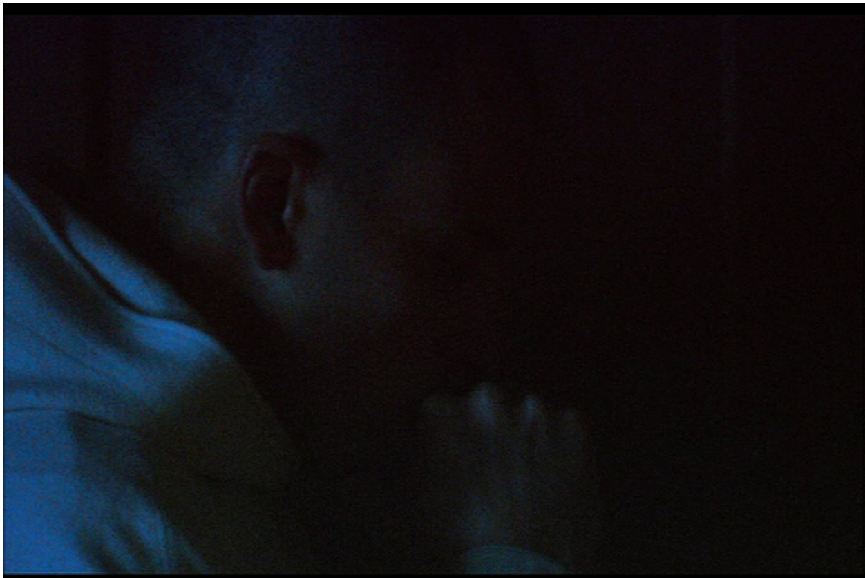
Figure 4.1: The limits of cinematographic vision in capturing both the object of prayer and the pre-dawn image of prayer in Into Great Silence .

this inner focus are primarily negations as the monks rigorously follow the prayer discipline of the canonical hours 31 and refrain from speech. As with I Was Possessed by God (2000), the tension created by the disparity between inner experience and outer expression is a driving force in the film. While Gröning occasionally manipulates a shot visually or aurally for impressionistic effect, such manipulations are not typical. More often the limits of the power of vision are stressed, especially in the frequent sequences of monks praying. The film opens, for example, with a scene of a monk praying in the early morning darkness. Due to the lack of light the image is barely visible 32 as the lack of contrast and prevalence of digital artifacts attest to the