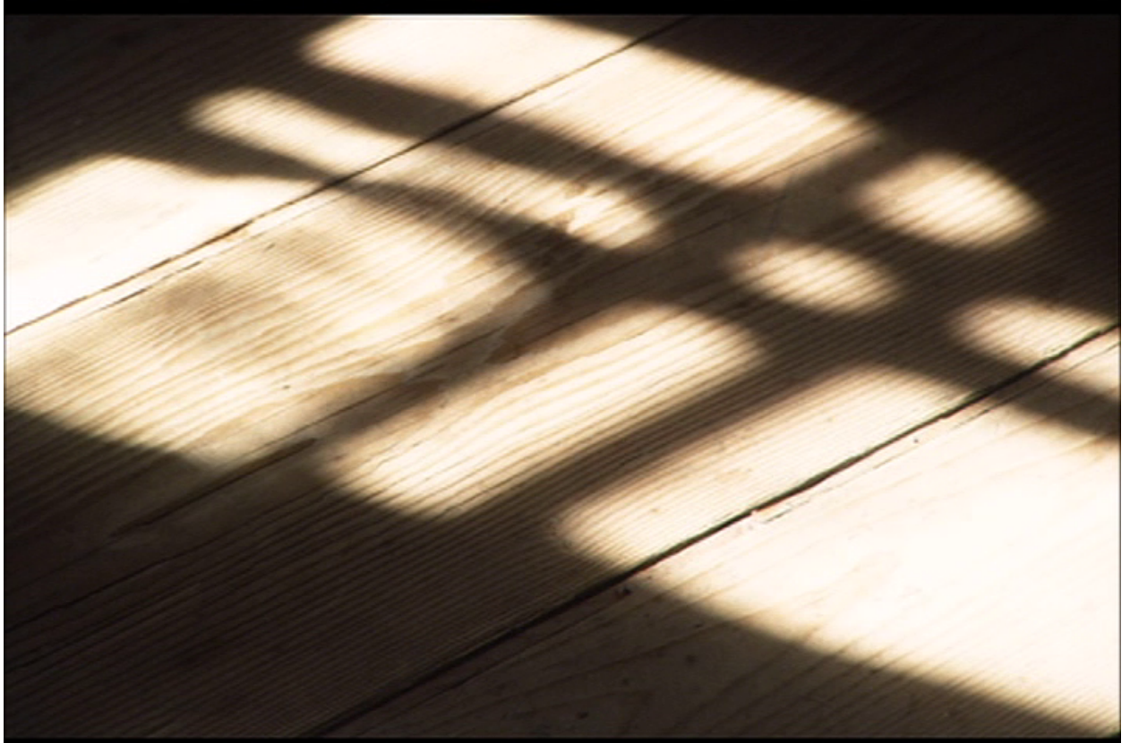
Figure 4.2: While a monk silently studies at his desk, the camera's gaze wanders and is captured by this play of light on the floor in Into Great Silence .

The negations of Into Great Silence also extend to the conventions of documentary form, as did the negations of I Don't Hate Las Vegas Anymore . This can most prominently be seen in the 'talking heads' sequences of the film, a series of close-ups of the monks themselves as if being interviewed. Each monk gets his own short one-shot close-up of 10-20 seconds of dedicated time with the camera in some of the only shots in the film in which the camera is acknowledged by those being filmed. Unlike the documentary convention, and a direct effect of their practice of silence, these talking heads do not say anything, an effect further emphasized by the almost complete lack of ambient noise during these shots. Split up into groups of three shots and often preceded by a title card with a scriptural or otherwise religiously-minded phrase, these 'interviews' are interspersed throughout the film. Particularly compelling for me is one that comes a little more than a third of the way through the film. "Behold the silence: Allow the Lord