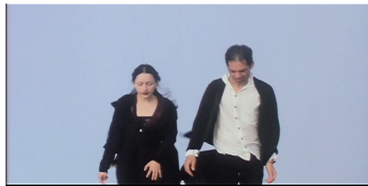
Figure 2.3: The typical shot grounding the characters within their San Francisco context in Sign gives way to the ungrounded low angle in the final scene.