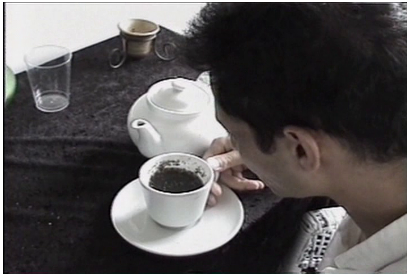
Figure 0.2: The identified psychedelic mushrooms in I Was Possessed by God .

the annoying, the amateur, and the homemade are present here while the titularly promised divine perspective, as well as a narratively promised psychotropic-induced perspective, are denied. While the film could give form to that which is invisible, through any number of special effects, giving that presence to absence would destroy its sacredness. To envision the sacred would be to destroy it, and I Was Possessed consistently denies that epiphanic drive. In this way the film serves as a good short example of Sitney's secular theology in its simultaneous emphasis on and denial of vision in an avant-garde work.