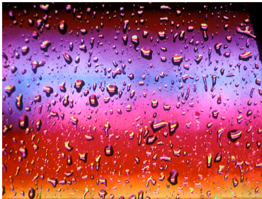
Figure 3.6: Shimmering-ness in a still from Variations .

light that relate shots ten and eleven back to shot two. This last visual connection is telling in that shots two and ten (light on water and light in clouds) shimmer as a result of the reflective qualities of the shots' contents (aided by a slight over exposure of the film), whereas the shimmering of shot eleven (foliage) seems to be primarily created as a result of the camera's settings. In other words, these shots all recall each other by virtue of their shimmering-ness, with no distinction made between what may have been a natural phenomenon and what was a camera-created one—it is the image on the screen, and not its referent, that is ultimately what is important.