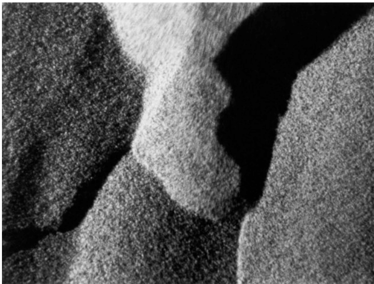
Figure 3.1: The intermixed sand and film grain of Alaya .

and seen; like the celluloid strip it is often the condition for seeing rather than the object of vision. In Alaya , this comparison between sand and celluloid is made in a number of ways. One is the comparison between sand grain and film grain in a series of recurring shots interspersed throughout the film in which celluloid graininess is accentuated in a medium-close shot of blowing sand. As the film grain and recorded sand grains are about the same size, they are impossible to distinguish from each other. 13