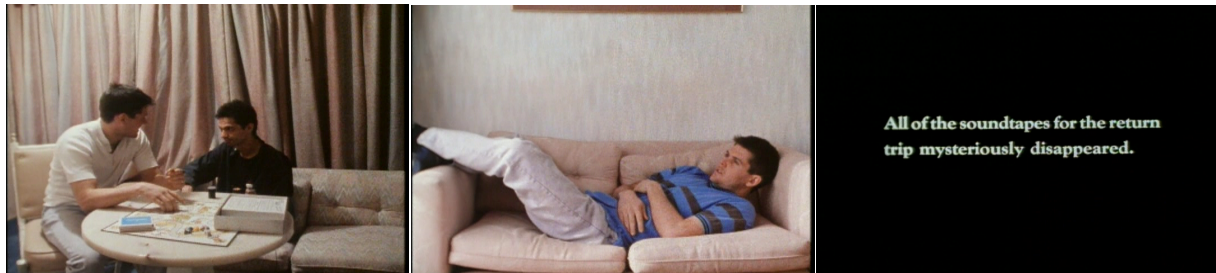
Figure 2.5: Images of silence in Vegas : a scene in which D is missing and therefore fails to turn on the sound recorder; Greg's purposefully silent confessional scene; and the drive home from Las Vegas to Los Angeles.