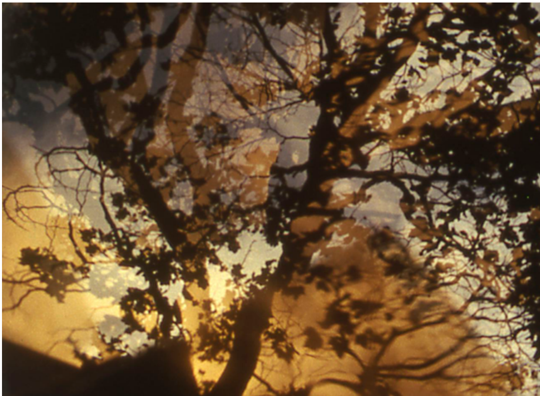
Figure 3.2: The rich textures and vibrant colors of Dorsky's images, seen in a still from The Return (2011).

film, most often they are characterized by a sense of discovery as the viewer initially encounters a disorienting shot and eventually identifies its content, initially obscured by focus, framing, or a lack of contextual information. With their rich textures and vibrant colors, Dorsky's films have a powerful materiality. Despite this, one never gets the impression that reality is simply