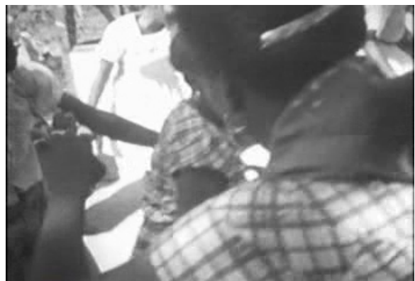
Figure 1.2: The camera moves through and within the filmed rituals in the Haitian footage, both recording and participating in them. Stills taken from Divine Horsemen (1985).

Approximately a quarter of this footage can also be seen in the 50-minute documentary Divine Horsemen (1985). 73 For the purposes of thinking about the Haitian footage, the documentary is useful, as it makes images from the footage widely available. As an edited work (by Chere Ito), however, it is also a prime example of a film that Deren herself chose not to make.