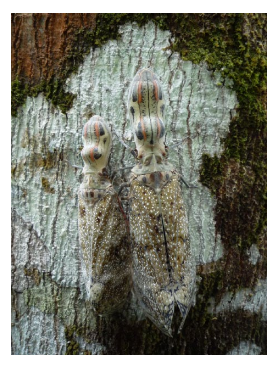
Figure 6. Butterflies inhabiting Pedro Pablo's reforestation project in El Trébol, Puerto Guzmán.