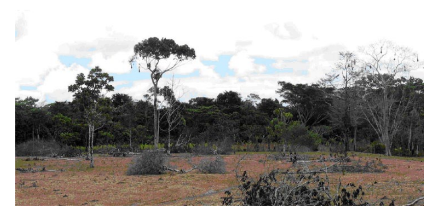
Figure 2. Defoliated forest and burnt fields resulting from aerial spraying with glyphosate in the municipality of Valle de Guaméz, Putumayo.

elucidate the dynamic and not-only-human actualizations of justice at stake in the aftermath of decades of chemical warfare (Figure 2).