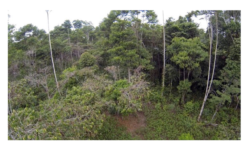
Figure 1. Aerial view of Pedro Pablo's fumigated silviculture in El Trébol, Puerto Guzmán.

reorganized into countrywide narco-criminal structures, such as Los Rastrojos, Los Urabeños, and Los Constructores. The Colombian government now refers to these groups as bacrim (emergent criminal bands), or more recently after the peace signing with the FARC-EP, as 'post-demobilization armed groups' (see Barbosa and Ciro, 2017).