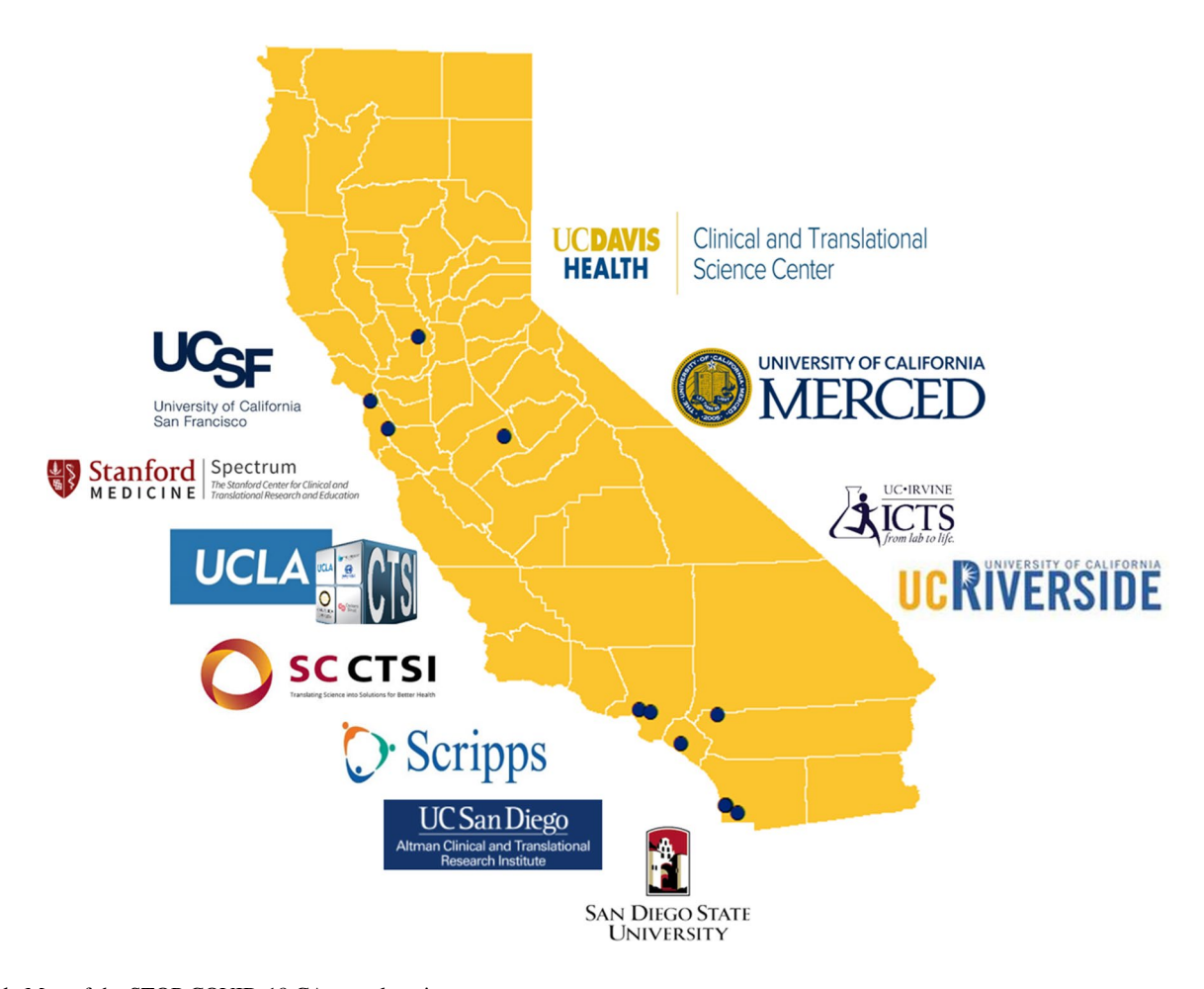
Fig. 1 Map of the STOP COVID-19 CA team locations

and messaging (see Supplemental materials). Our biweekly Communications Workgroup (henceforth referred to as "Workgroup") meetings were grounded in principles of community engagement, social justice, and cultural humility, meaning we kept open minds to learn from others and reflect upon personal biases. Our Workgroup members represent academic and community partners across urban and rural areas of the state working with diverse racial/ethnic groups (i.e., Latino/x, Black/African Americans, Native Hawaiian and Pacific Islanders [NH/PIs], Indigenous populations, Asian Americans) and people in high-risk occupations (e.g., farmworkers, community health workers). Each academic site had longstanding relationships with community partners from previous collaborations and the academic institutions had existing ties to each other as well. The community organizations include community advocates, community health workers, non-profit leaders, government officials (i.e., county and state public health departments), communitybased media and immigrant advocacy organizations. For some of the community organizations, this initiative was the first time they had become involved with public health issues.