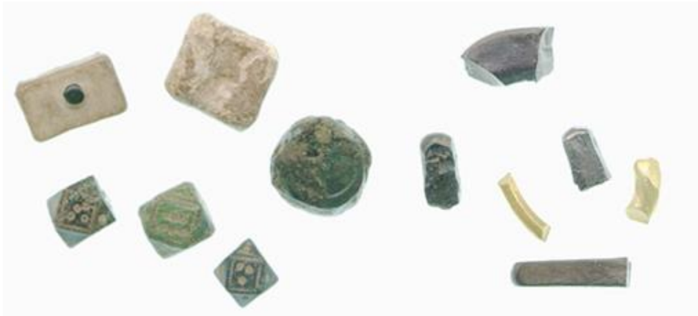
Fig. 4 38 Bullion weights from Torksey c. 870s.

system in late-ninth century East Anglia combining coinage with Scandinavian hack silver and bullion weights is significant.