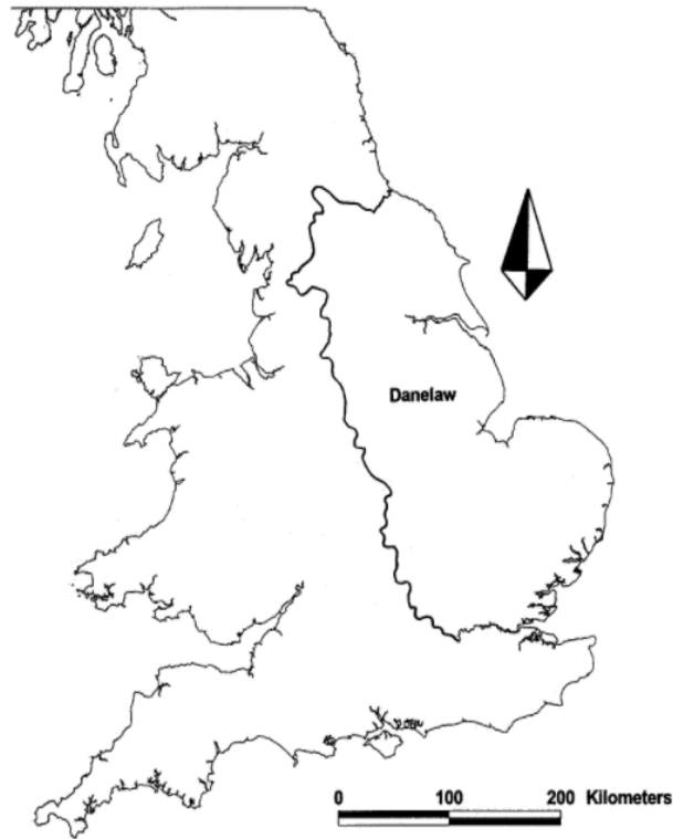
Fig. 1 5 Map of the Danelaw

The Danelaw -although not a formally defined area- at its height comprised roughly half of modern day England. The Danelaw was an area of recognized Scandinavian rule following Danish law 6 , and it was within this region that many examples of Anglo-Saxon and Scandinavian influences converged to produce examples of hybrid culture. These examples demonstrate the complexities of identity expression in a unique period that some argue paralleled the formation of a proto-English identity. 7 Therefore, by focusing on the existence of a diverse range of regional identities, the narrative of the Viking Age in England is further nuanced in a manner