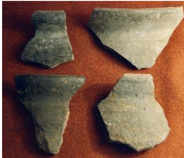
Fig.3 30 Examples of Ipswich Ware sherds

pieces of IW pottery. 28 In an attempt to partially account for the dearth of IW pottery sherds in Hamwic, and in Wessex as a whole, an argument was made for a Wessex resistance to the material culture of eastern kingdoms such as East Anglia during the eighth century. 29 This resistance to IW pottery produced in the eighth and early ninth centuries highlighted by Blinkhorn illustrates not only a rejection of material culture, but it also suggests a larger cultural divide between the Anglo-Saxon kingdoms that existed prior to the beginning of the Scandinavian raids in the late eighth century.