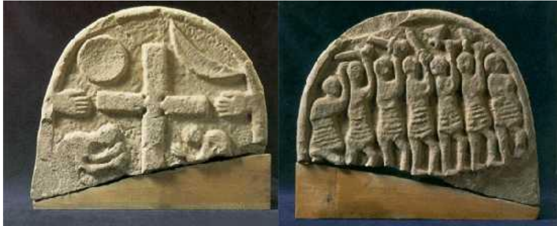
Fig. 7 60 Lindisfarne Stone, c. ninth century

understanding the depiction on the Lindisfarne stone. The earliness of this artifact in relation to the beginning of the Scandinavian raids presents an interesting point of departure from which to trace the depiction of raiders by Anglo-Saxons and the Anglo-Scandinavian religious interactions over the next century and a half.