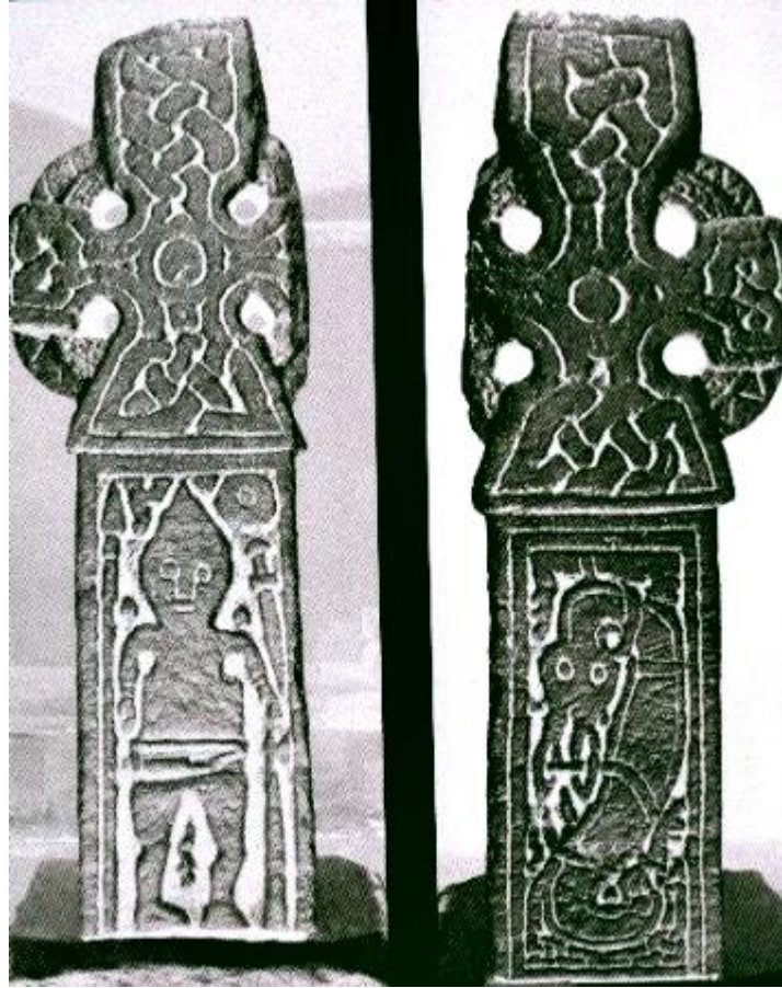
Fig. 8 71

Two-part image of the front (left) and back (right) of Cross B