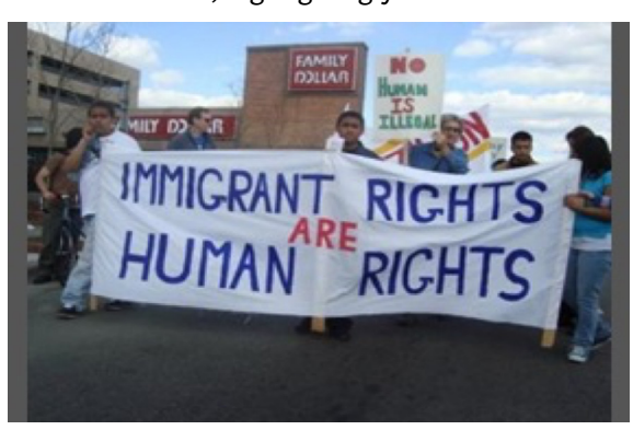
Immigrant advocates regularly make claims using the language of human rights. How do California voters respond to such framing strategies?

The number of unauthorized immigrants in the U.S. has fallen to its lowest level in more than a decade, yet anti-immigrant politicians have achieved significant electoral and policy victories while the pro-immigrant rights movement seems to have lost traction. To understand how pro-immigrant allies might effectively advocate for undocumented people, BIMI-affiliates Kim Voss and Irene Bloemraad, along with co-author Fabiana Silva, asked over three thousand registered California voters what should be done to help California residents — including undocumented residents — needing health care, facing sexual harassment, or going hungry.