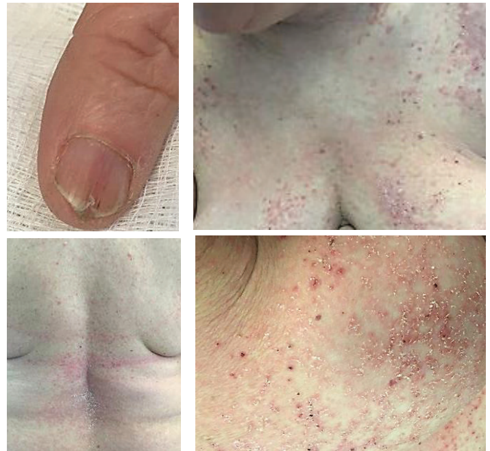
Figure 1. Fingernail with v-shaped notch along the free margin and parallel red bands. Torso with erythematous papules and yellow-to-flesh-colored, crusted keratotic papules coalescing into plaques.

emerged during adolescence. The lesions were occasionally pruritic and malodorous. The symptoms were worsened by heat, friction, and sweat. In the preceding years, the patient had been treated for bacterial superinfection of her inframammary folds with intravenous antibiotics and also for cutaneous herpes simplex virus infection with oral acyclovir. Social history included alcohol abuse. The family history included a similar eruption in her father and paternal grandmother, both of whom also had undiagnosed psychiatric diseases.