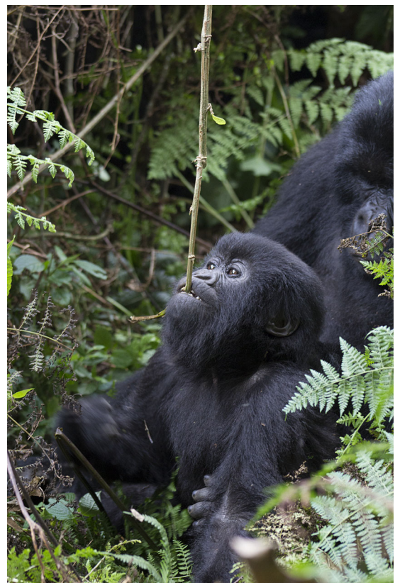
Fig. 1. Infant mountain gorilla playing with Urera species vine in Volcanoes National Park, Rwanda (Photo T. Smiley Evans).

human-habituated mountain gorillas, all accessible habituated gorilla groups in the Volcanoes National Park, Bwindi Impenetrable Forest, and Mgahinga Gorilla Park were visited a minimum of three times. Discarded plant samples ( n = 383 ) were collected from 294 individual mountain gorillas from 26 family groups between the months of November 2012 and June 2013. When possible, plants discarded by every individual within a family group were collected. Gorillas were observed from a minimum of 7 m while they ate and discarded pieces of plants (Figs. 1 and 2). Gorillas were identified using facial features with the help of trackers and guides that were familiar with each individual in the group. Infants were defined as gorillas <3 years of age, juveniles as 3–5, sub-adults as 6 to 7, adult females as 8 years old and greater, black-backs as males 8–11, and silverbacks as males 12 years old and greater [Robbins et al., 2009; Williamson & Gerald-Steklis, 2001]. Samples of dropped plants were collected when a gorilla moved a minimum of 7 m to a new foraging area. Using gloved hands, the most bitten or chewed portion of a discarded plant, as determined by teeth marks and visible deposited saliva, was cut using disposable sterile scalpel blades and plant pieces