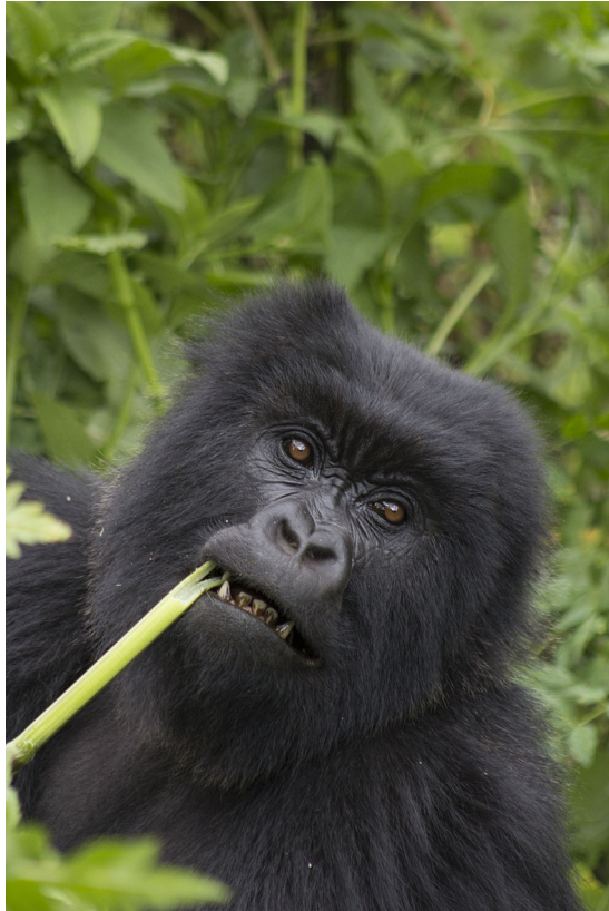
Fig. 2. Female mountain gorilla eating wild celery ( Peucedanum linderi ) in Volcanoes National Park, Rwanda.