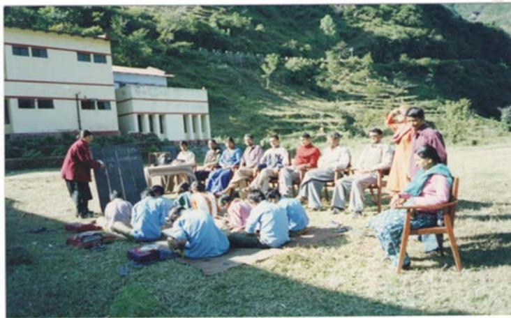
Figure 2. Model Essay Contest , Raji Residential School, Jauljibi

Introducing native literacy for an oral language can have many positive and negative implications. Some negatives are highlighted by Hinton (2001) such as - native speaker's loss of control over the language; freezing of the language and disagreement within the community. Positives of writing the oral language include- written language documentation for language survival; expansion of language use to other domains; empowerment of the community. During the early years of my work I had realized that Rajis have very negative attitude towards their mother tongue. They seem to be acutely aware of the fact that their mother tongue has very little scope in promoting upward mobility and it will not provide them food, education etc. The attitude of the dominant group was also not very encouraging. So in Raji's context the question whether to write down their language or not was never important because their language was neither important for them nor they had any sense of pride for their mother tongue. Gradually I started working in this direction and after working with them for around nine years I succeeded in instilling the importance of their mother tongue and the need for its preservation. As a result many youngsters and some middle aged Raji came forward and helped me in the present orthography development programme.