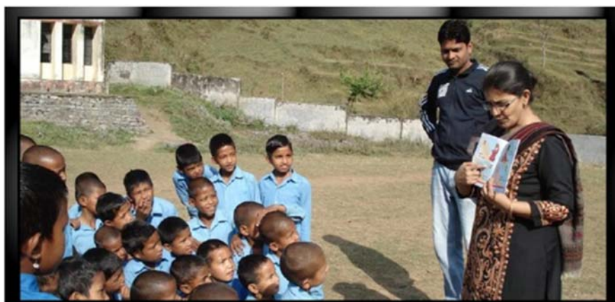
Figure 3. Distribution of RAJI alphabet reader at Raji Awaasiya Vidyalaya, Jauljibi

This work describes the process and methodology of Orthography development of Raji, a previously undocumented language, spoken by a small number of speakers in the district of Pithoragarh. This work was done in collaboration with the community. My role was to make them aware regarding the importance of documentation and preservation of their mother tongue. I provided them guidance with linguistic issues and spelling options. Some of the decisions taken during this early stage may need revision in future. As mentioned earlier in the next phase I prepared an Alphabet reader “Raji varna mala” for the community.