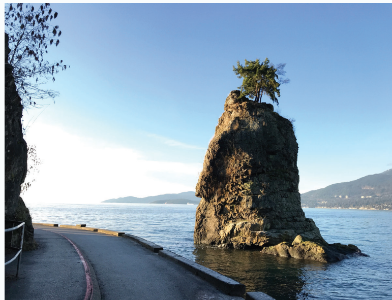
▼ Siwash Rock