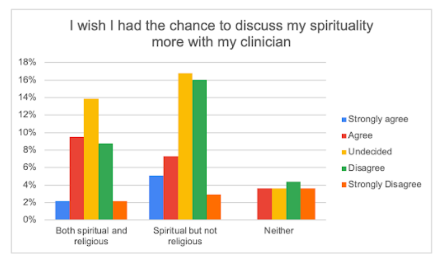
Figure 1. Percentage of survey respondents who did or did not want to further discuss spirituality in mental health counseling. Only respondents who answered the question in the title were included, resulting in 137 respondents.