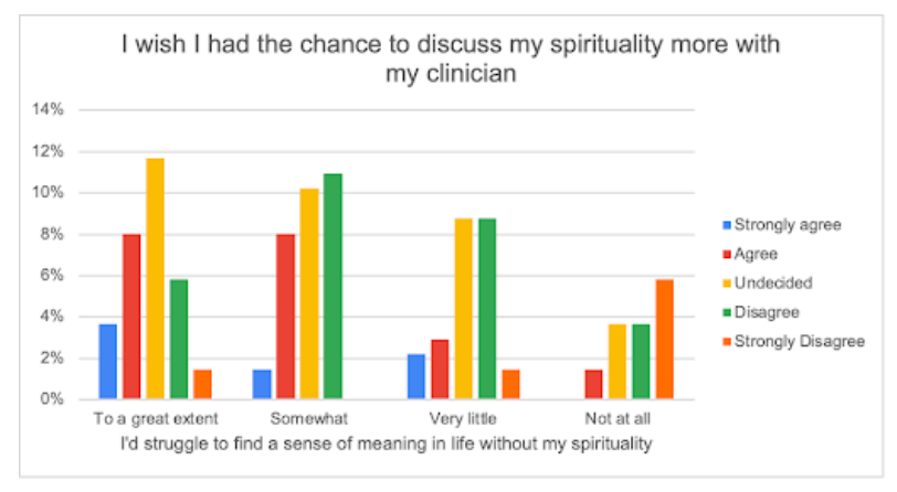
Figure 4. Percentage of survey respondents who felt or did not feel the need to discuss spirituality more than they did with their clinician compared with the degree to which spirituality helps them find meaning in life. Both questions were answered by 137.