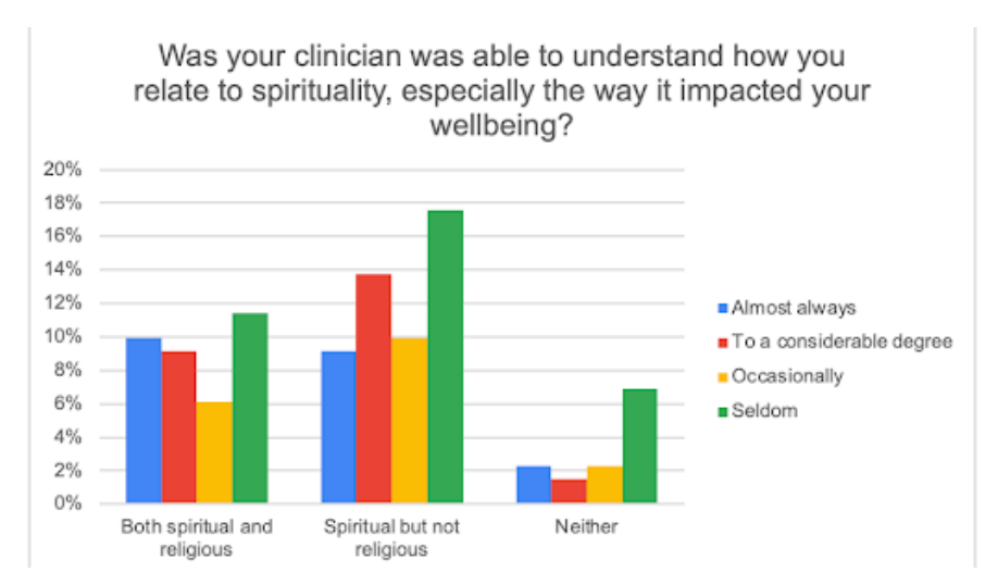
Figure 2. Percentage of survey respondents who felt or did not feel that they were spiritually understood in mental health counseling.

Figure 3 provides a more specific look into spiritual sensitivity in counseling practice by building off of figure 2, but includes a measure of spiritual practice as a way to understand client outcomes in the context of their own interest in spirituality.