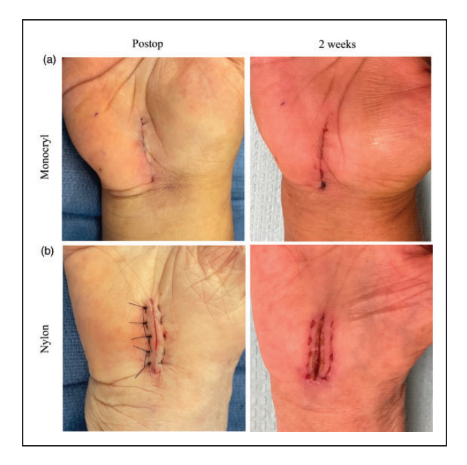
Figure 3. Scar appearance following Monocryl (a) and nylon (b) wound closures immediately postoperative and at 2 weeks.

Our study has limitations. Based on our a priori power analysis, our study was underpowered to detect a difference in patient and observer scar assessment scales between Monocryl and nylon at 6 weeks. However, it is our experience and impression while conducting this study that the majority of patients in both groups were fully healed by 6 weeks with only minimally noticeable difference in their scars. Indeed, many patients questioned the need for the 6-week postoperative appointment, and only 62 of the 104 patients returned to complete the