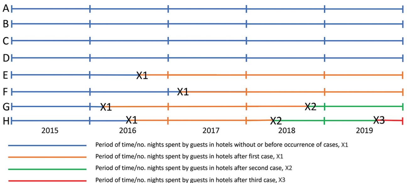
Figure 1. Penile lesions and papules associated with clade I monkeypox virus infection in a man in his late 20s who reported having 2 sexual encounters with a man in Europe 1 week before arriving in Democratic Republic of the Congo.

A man from DRC in his late 20s (case-patient 1) reported having 2 sexual encounters with a man (suspected primary case-patient) in Europe 1 week before returning to DRC. The suspected primary case-patient frequently visited DRC. Case-patient 1 reported that the primary case-patient had general clinical symptoms including genital pruritus, joint pain, and physical asthenia. Nine days after contact, case-patient 1 began experiencing pruritus, vesicular skin eruptions, and genital and perianal ulcerations. He contacted a local civil organization, which initiated a preliminary investigation and alerted the National Programme for the Control of Monkeypox and Viral Hemorrhagic Fevers. He had penile lesions and penile papules (Figure 1); localized redness on the lips and in the oral buccal mucosa were also noted, and he had 1 lesion on the middle finger of the right hand. Blood samples, oropharyngeal swab samples, swab samples from rectal and genital lesions, and swab samples from vesicles on the skin of the penis and pubis were taken.