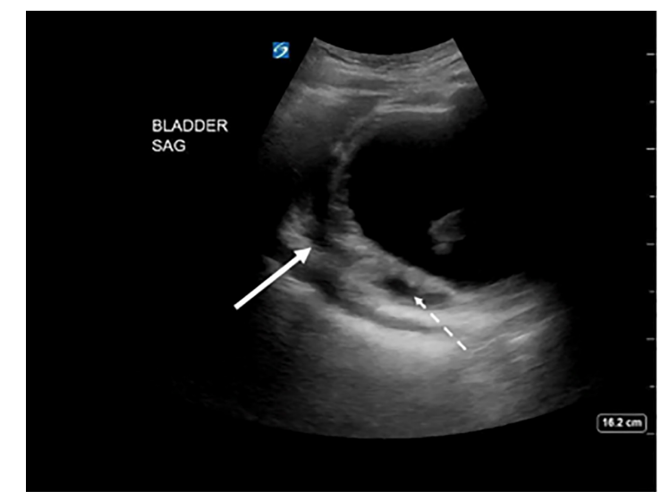
Image 1. Sagittal view of the bladder on point-of-care ultrasound showing posterior, fluid-filled loculations (solid arrow) and wall thickening (dashed arrow).

The patient was found to be anemic with a hemoglobin of 5.5 grams per deciliter (g/dL) (reference range: 14.0-18.0 g/dL). His renal function was slightly worse than his baseline with a blood urea nitrogen of 39 milligrams/dL (11-23 mg/dL), and creatinine of 1.50 mg/dL (0.7-1.5 mg/dL). His urinalysis was positive for leukocyte esterase, nitrites, and moderate red blood cells. After placing two large-bore