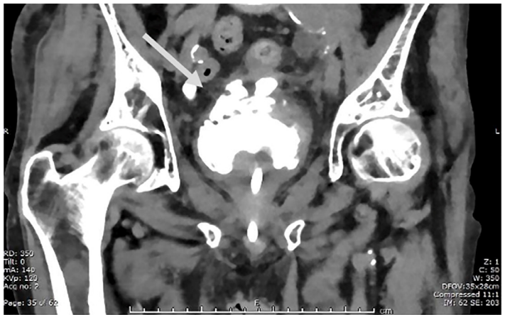
Image 3. Computed tomography cystogram showing extravasated contrast contained in the extraperitoneal space (arrow).

Bladder rupture is commonly associated with blunt abdominal trauma or surgical complication.<sup>2</sup> It is a rare complication of Foley catheter insertion.<sup>3</sup> Bladder rupture is generally categorized as either intraperitoneal or extraperitoneal, or combined.<sup>2,4</sup> It usually presents as acute abdominal pain, typically in the setting of trauma or after