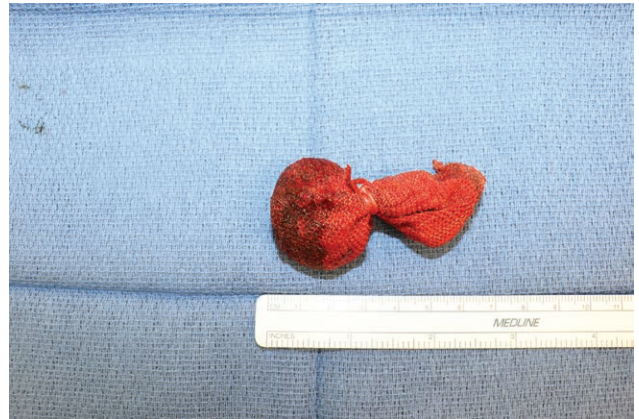
Fig. 3. Bean bag munition extracted from the patient's left maxillary sinus.

of the foreign object retained in his maxillary sinus, and for open reduction and internal fixation of his zygomaticomaxillary complex fracture. The first step in the operation was to retrieve the foreign body through the open wound created by the initial impact from the munition on the left side of his face. The bean bag munition that was removed from his left maxillary sinus can be seen in Figure 3 . Upon removal of the bean bag, the fracture sites were exposed through the infraorbital mid lid, eyebrow, and intraoral vestibular approaches. A 3-point