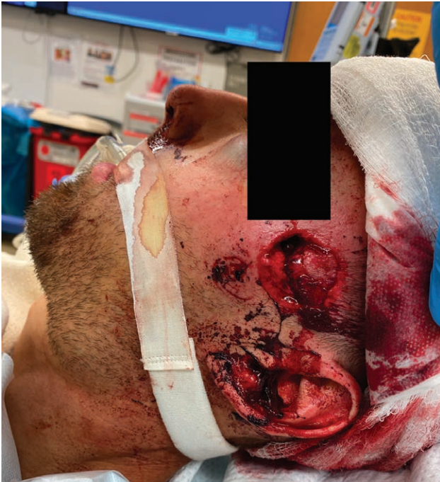
Fig. 1. External appearance of the patient's injury upon initial presentation. On digital examination of the wound, a depth of approximately 4 cm was palpated.