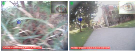
Figure 2. Left – Example of a sniffing bout on a plant (fixations where dogs had 2 or fewer objects present in their view) vs Right – Example of a normal fixation to a plant. Sniffing bouts were removed prior to analysis because the proximity of the objects of focus made it likely that they were using another sense, like olfaction.

primary focus of this study was how dogs interact with their world visually, so instances where dogs were relying on another sense (such as while sniffing) were removed. Sniffing bouts were defined as looks where two or fewer objects were present in the environment. As an example, when a dog was sniffing a pole, the only objects visible in the environment were the pole and the plant and both were so close to the camera it's unlikely that the dog was visually considering them (see Figure 2).