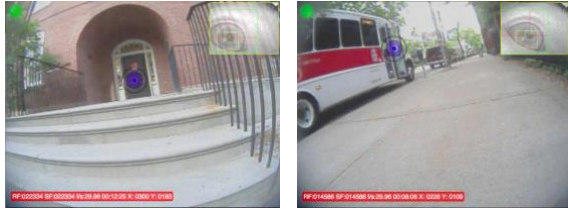
Figure 4. Dogs looked to specific components of objects like the doorways and windows of buildings, as well as the open doors of a bus, potentially looking to where they expect people may appear.