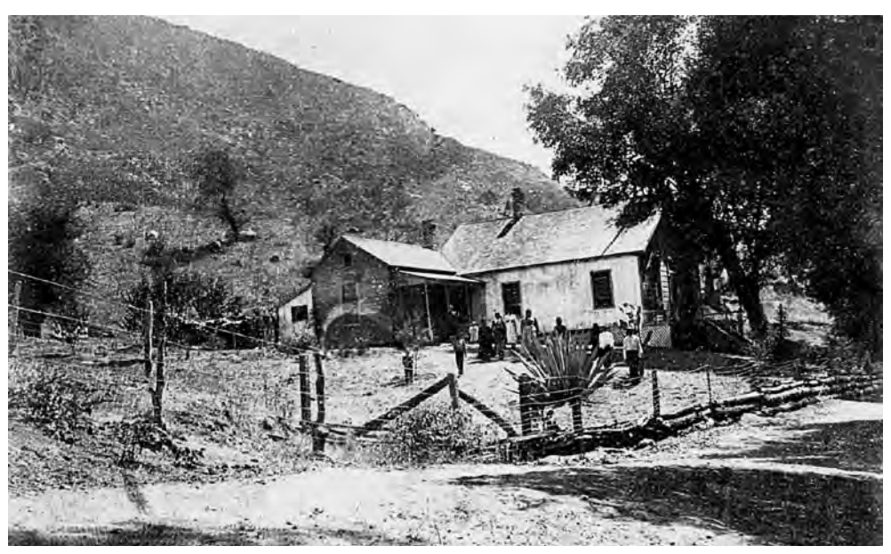
Schoolhouse at Capitan Grande, ca. 1900-10.

potentially involved millions of dollars. One federal employee publicly accused Willis of collecting $88,000 from the Mission Indians to enrich himself. The Baron Long's ranch purchase was now a strategic asset in a larger struggle in which the stakes were large.<sup>34</sup>