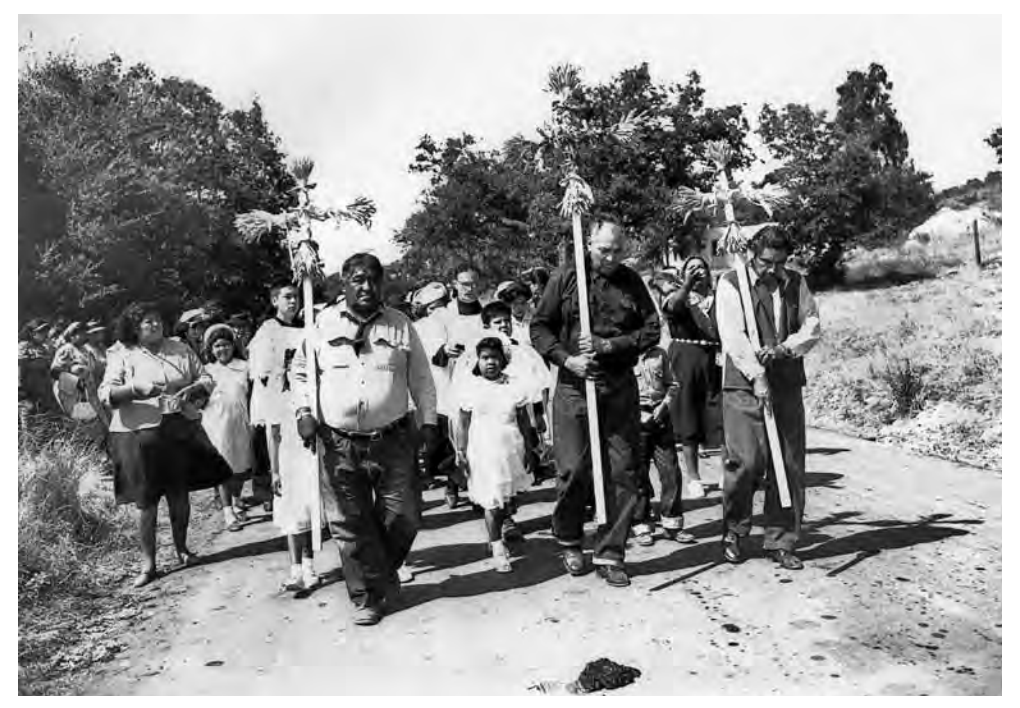
The Blessing of the Cross Festival at the Barona Indian Reservation, August 15, 1952.

official commitment to the same. The new home of the Capitan Grande Indians at Viejas did not provide its population with economic self-sufficiency or even measurable improvement in their standard of living until the advent of Indian gaming in California in the 1980s. Because they had relocated as a group to federal trust land after a hard-won struggle in the 1930s, the Viejas people capitalized on their quasi-sovereign status and limited immunity to state law, just as the Baronas did. Invaluable water rights to the San Diego River were lost, but the large Capitan Grande reservation—an anomalous reservation without Indians—continues to be owned collectively by the Barona and Viejas people as "successors in interest." El Capitan stands as a mute witness to an important, but little known, episode in San Diego history.