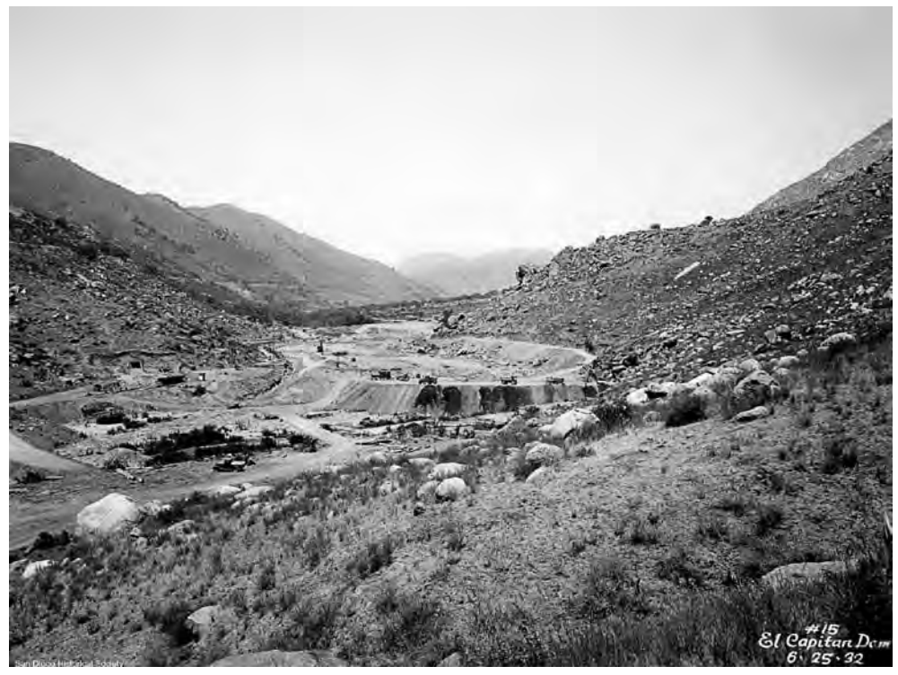
El Capitan Dam under construction, June 25, 1932. ©SDHC #4334-A-15.