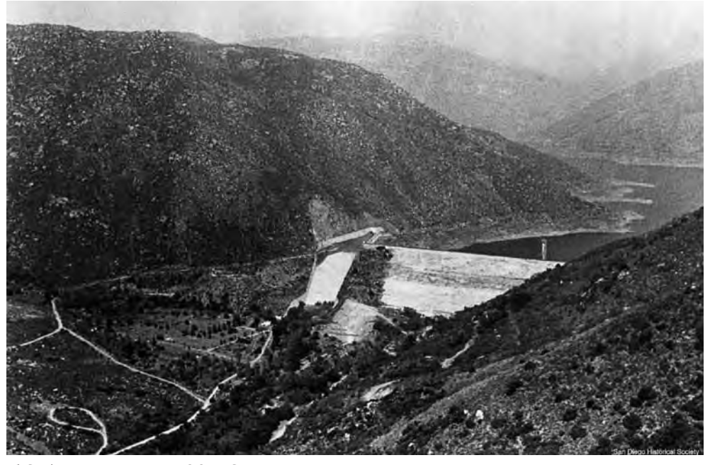
El Capitan Dam, June 1955.

The BIA and the City of San Diego sought, first, to move the Paipa group and their graveyard from the flood zone, preferably without the use of force; and, second, to persuade the Conejos group to move away from Capitan Grande voluntarily, preferably as individual family groups severing their tribal ties. Federal bureaucrats, enmeshed in the social-engineering mentality of the age, assumed that the superior planning by intelligent, professional experts would neutralize the Federation's influence. "Whether [the Paipa group] will move before it becomes