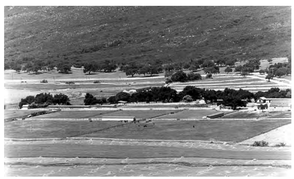
Baron Long Ranch, ca. 1930, was a level, fertile field on the floor of the Viejas Valley. When this photo was taken, erosion was negligible.

on non-Indians.<sup>15</sup> The so-called "Scattergood suggestion" was dispersal: "ending of tribal life and location [of Indians] on individual plots of land near population centers."<sup>16</sup>