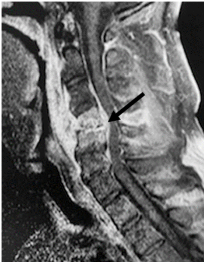
Image 2. Magnetic resonance imaging of sagittal plane of cervical spine showing fourth and fifth cervical osteomyelitis (arrow) upon admission.

around the cervical spine and to defer the initiation of antimicrobial therapy until after the biopsy was obtained.