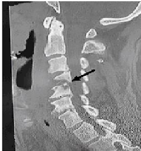
Image 1. Computed tomography scan of sagittal plane of cervical spine showing fourth and fifth cervical osteomyelitis (arrow) upon admission.

Early diagnosis of CCS caused by infection may allow alternative, non-surgical management that improves patient outcome.