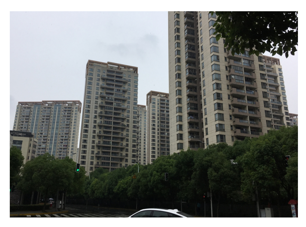
Figure 4 Lianyang Biyun Community in Pudong. Photo by author in June, 2017.