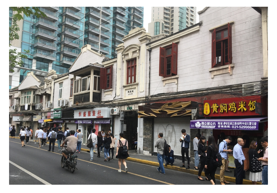
Figure 1. De Qing Li on Maoming Bei Road. Photo by author in May, 2017.