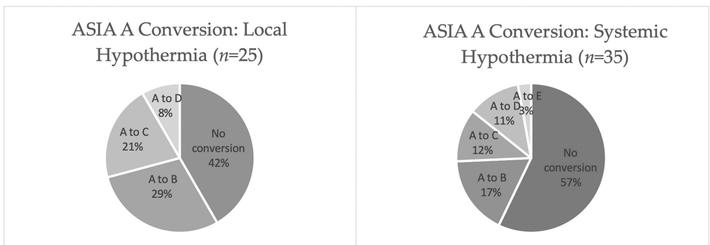
Figure 2. ASIA score conversion in individuals with TSCI who received hypothermia therapy.

Cumulatively, 43% of patients ( n = 15 ) with AIS grade A converted to grade B or better following systemic hypothermia therapy and 58% of individuals ( n = 14 ) with grade A injury converted following local hypothermia (Figure 2). Of note, the AIS A conversion rates of the 31 patients with cervical injuries who received systemic hypothermia (35.5%) were higher than those from 3 major SCI database control studies of patients with cervical injuries who received standard care (26.1%) [44,47–49]. Furthermore, Hansebout and Hansebout reported that 9 out of 14 (64%) patients from their study with cervical TSCI converted from AIS grade A to B or better [45]. None of the patients reported by Gallagher et al. experienced a cervical injury [46]. All clinical studies reported that no neurologic deterioration occurred in any patient as a result of hypothermia treatment.