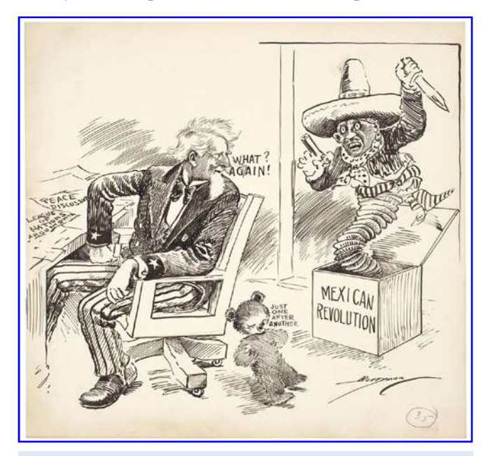
Figure 1: "Just Another Mexican Revolution"

at a secondhand shop and imaging a sexual relationship with a fictitious Mexican woman, named Conception, who used to own them. Eventually, this man finds his dream Mexican women in real life, and they marry and live happily ever after. Upon further investigation this work is also filled with stereotypes, when this man was making love to Conception, he states, "the low neck of her gown fell softly from a creamy throat, and only half concealed the sweet roundness of her breast's that pulsed with life and desire."18 The stereotype of Mexican women as voluminous and sexual creatures is present in his description of Conception. Also, the description of Conception's "creamy throat" exemplifies the desire of light-skinned Mexican women. This is yet another example of how Mexican women were erotically fetishized viewed through fictional pieces. Naming the character Conception was a symbolic representation of the conceptions of